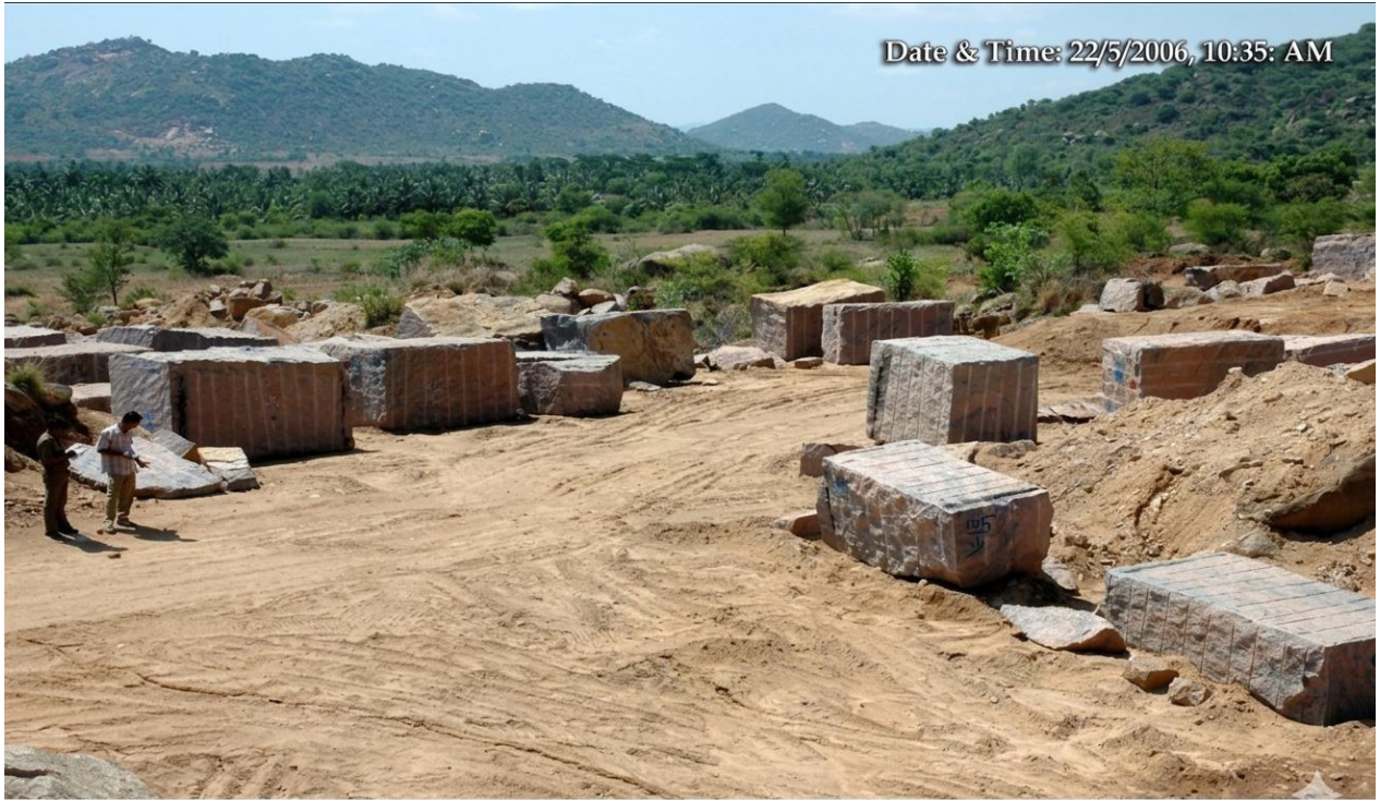
Figure 17: Sy#107, Shilpa Granites,107 Inside Arkavathi (M/f) Dumping Blocks on the Road