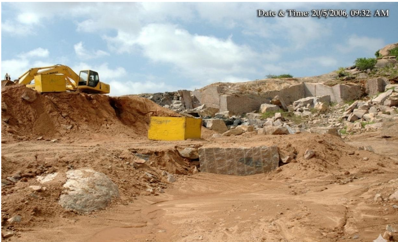
Figure 8: Survey no,67.Prabhath Quarry, Waste dumping with Hitachi(within 100 mts, active)