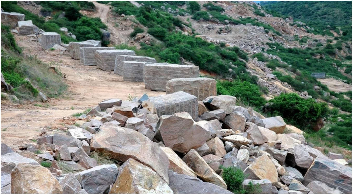
Figure 3: Granite quarries in Maralebekuppa village