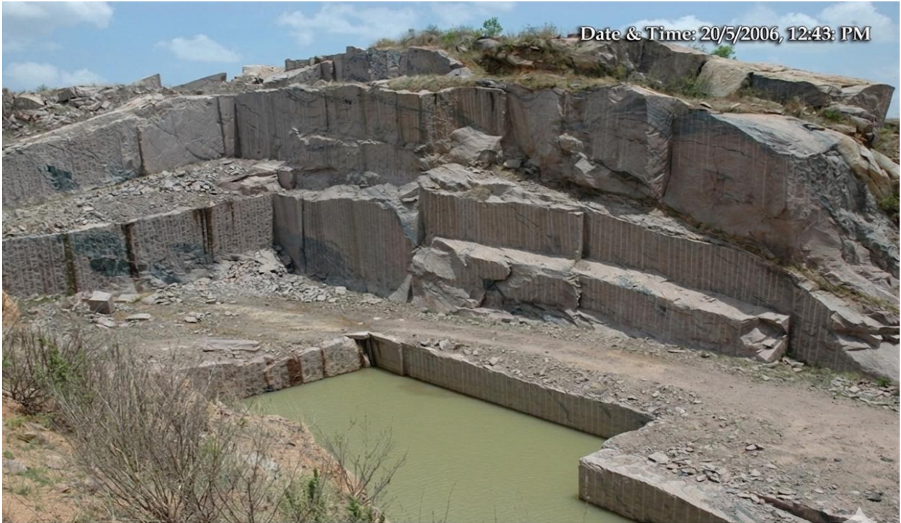
Figure 13: MML, 42 Of Nidagallu Site 3, Quarry Pit-1, Within 100 Mts,(Active)