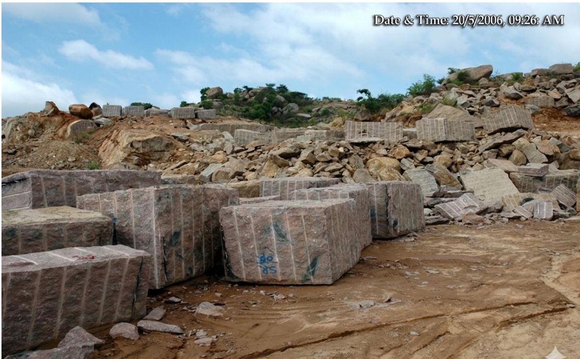
Figure 20: Survey no,67. M.N.Manjunatha( within 100.mts) blocks & waste dumping