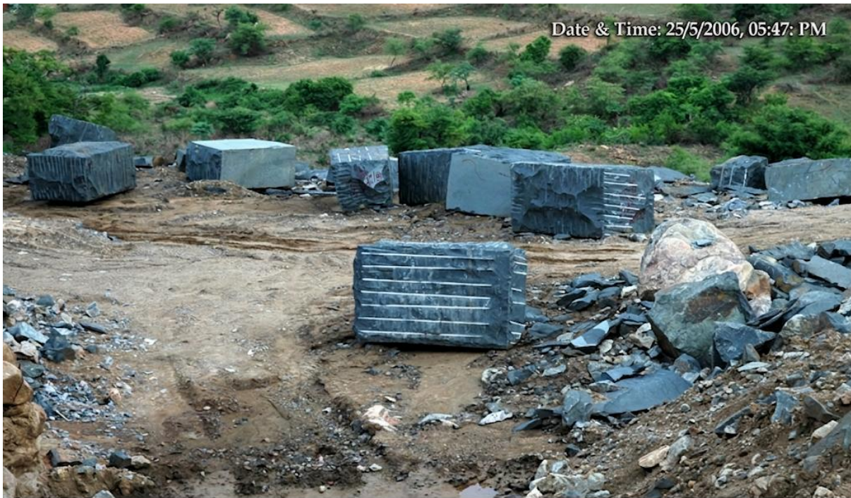
Figure 24: Sy# 27, (Part ) of Bijjahalli Siddarabetta Minor Forest- within Forest Chandrakala Active - Blocks