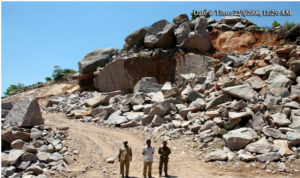
Figure 21: Kunoor Sy# 303 & 304, Soni Granites inside Arkavathi M/f Overall view of Quarry & Dumping ( Active)