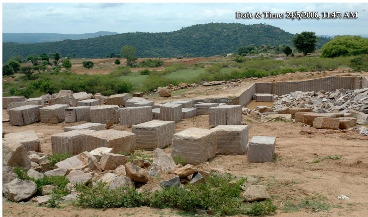
Figure 22: Sy#64 of Salabanni, Outside Forest Overall View of Quarry Pit With Waste Dumping & Blocks