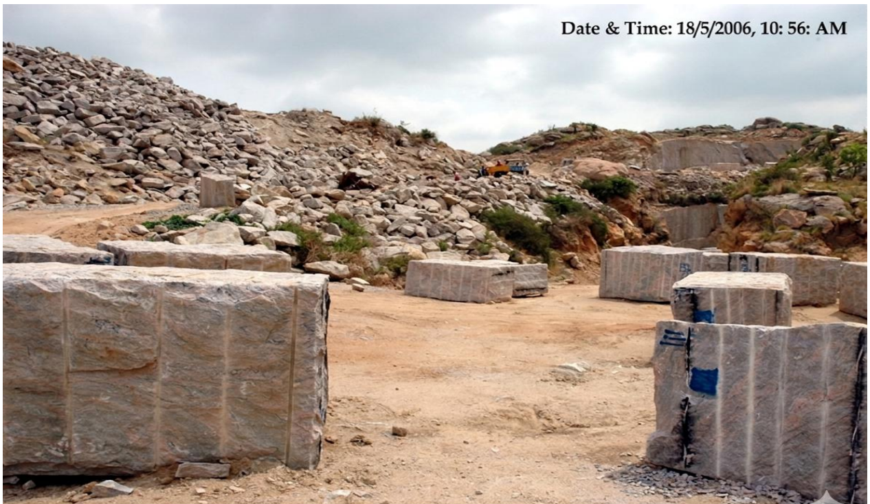
Figure 18: Quarry No,1 of Niranjnmurthy Block With Dumping Area Survey no.154