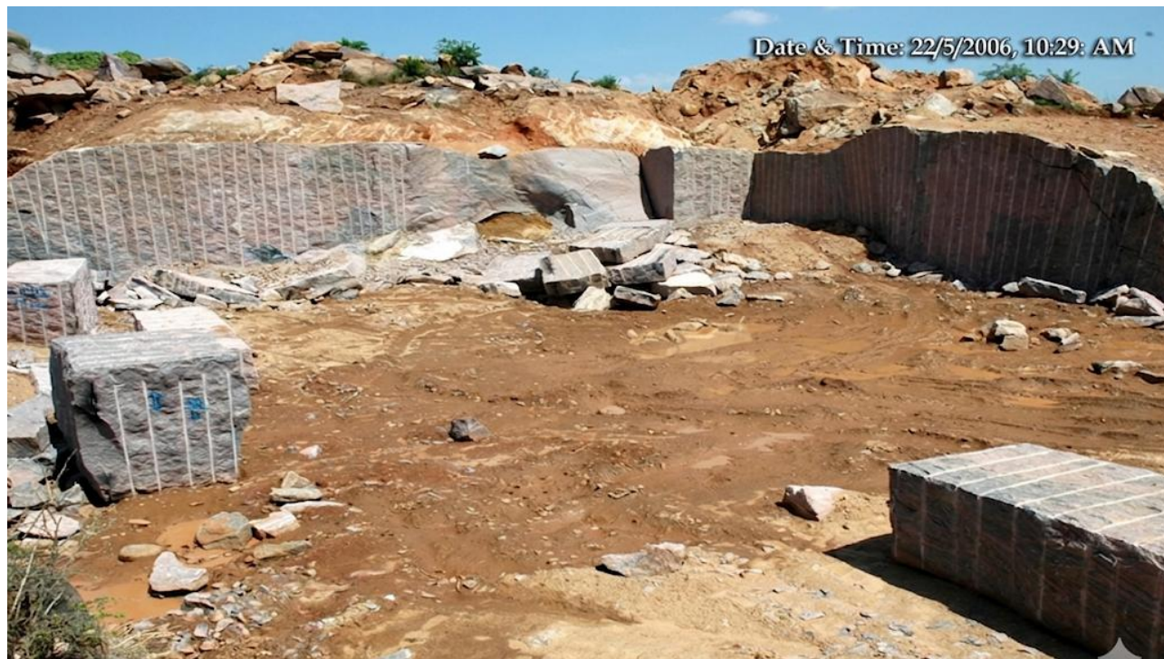
Figure 15: Sy#107, Shilpa Granites,107 Inside Arkavathi (M/f) Quarry Pit With Block