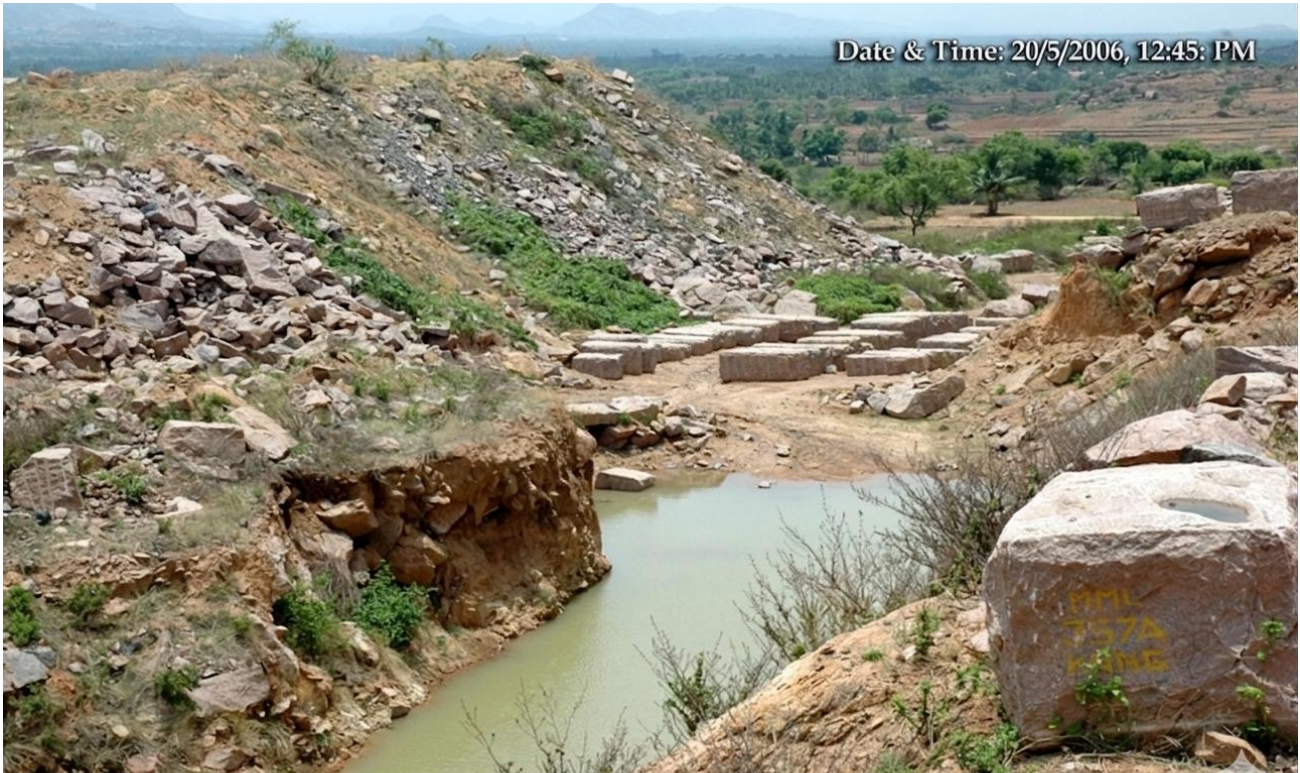
Figure 14: MML, 42 Of Nidagallu Blocks & Dumping Within 100 Mts,(Active)