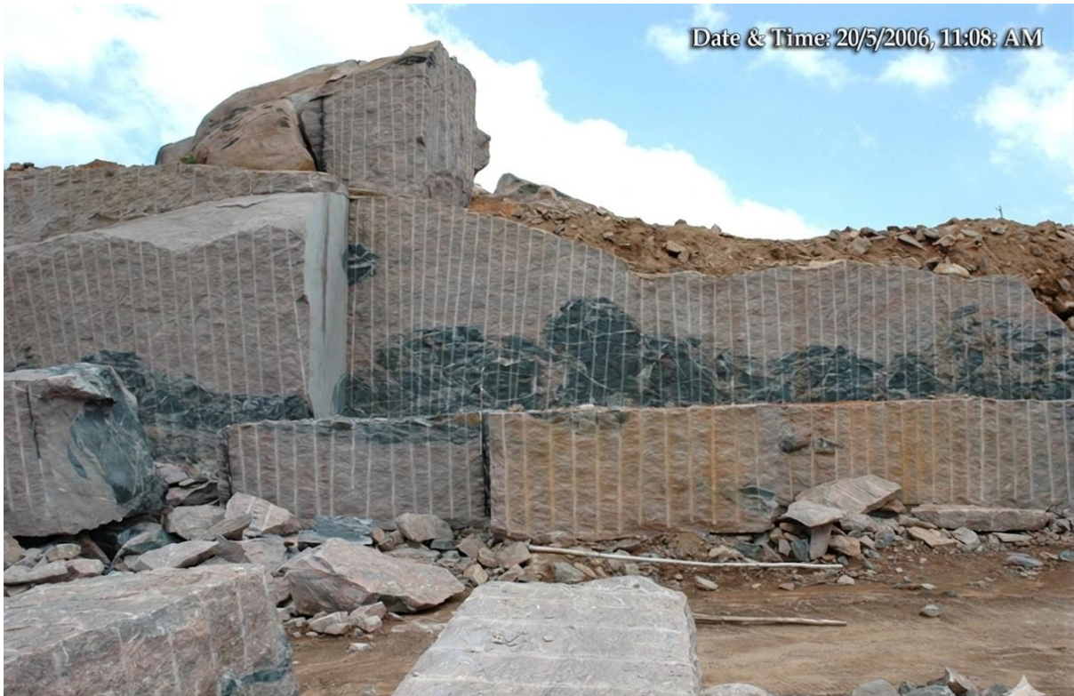
Figure 5: (Sn# 112), MML Quarry site 1, Near/Adjoining to forest point of jenukal gudda (active)