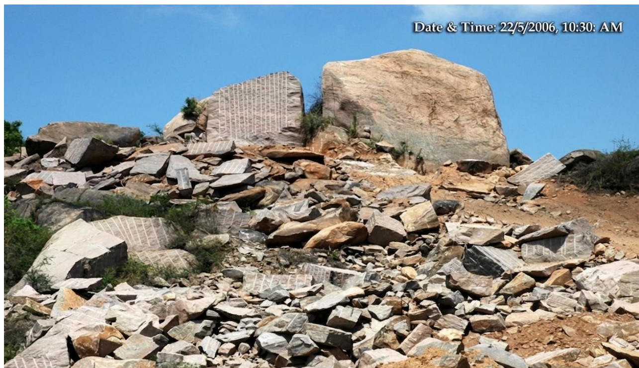
Figure 16: Sy#107, Shilpa Granites,107 Inside Arkavathi (M/f) Quarry & Dumping