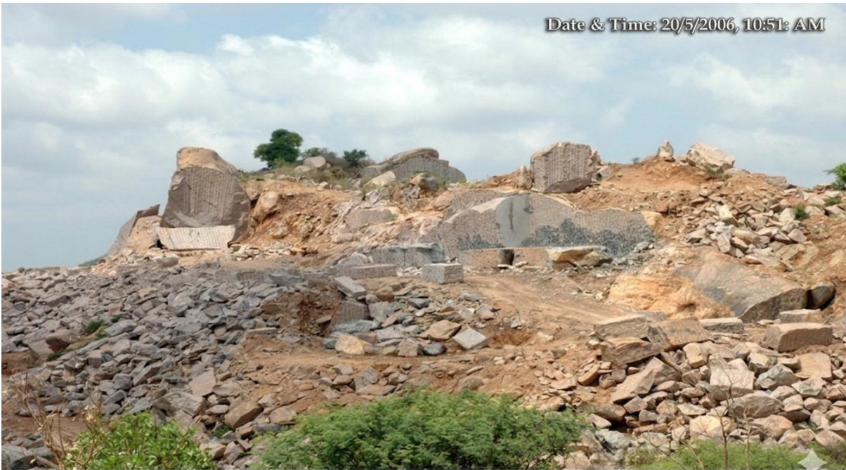
Figure 11: Survey no,67. overall view of mml(sn#112),Quarry & Dumping Blocks, active