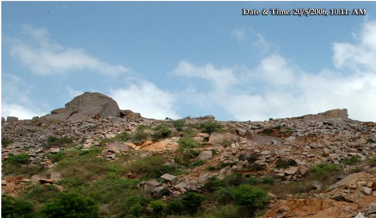
Figure 9: Survey no,67.(outside forest within 100 mts) active overall view of MML(S#112)