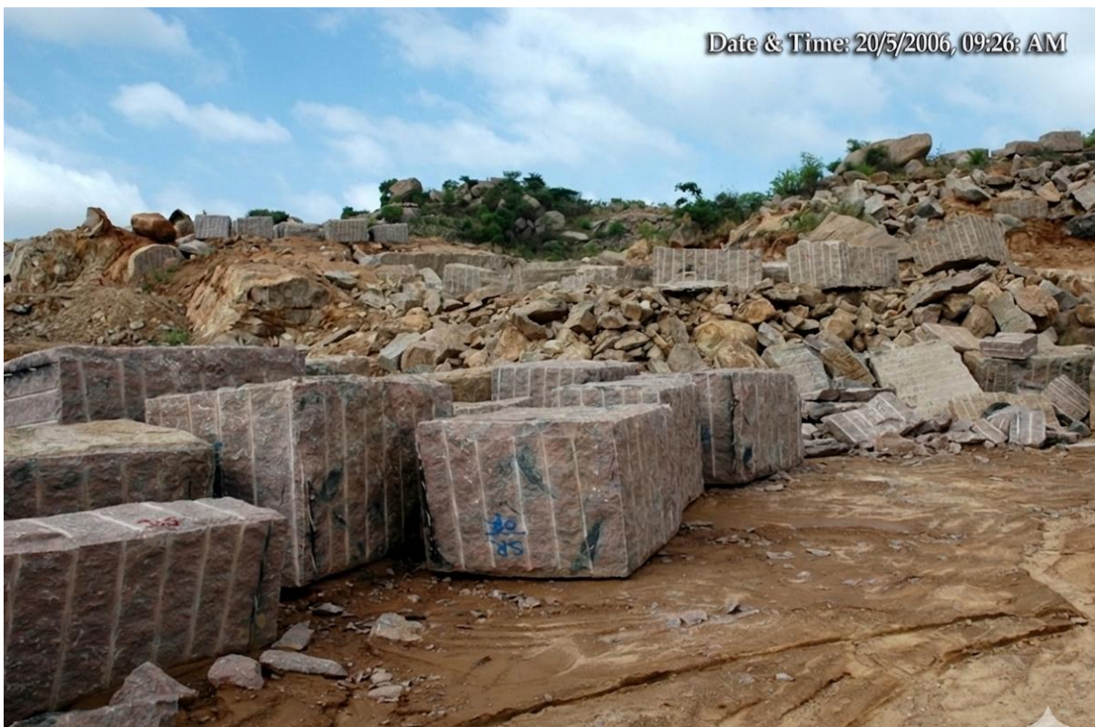
Figure 10: Survey no,67. M.N.Manjunatha( within 100.mts) blocks & waste dumping