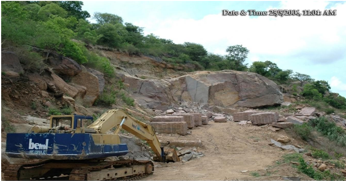
Figure 23: Sy# 126, of Thattekere Village, (Near by R.D.Betta, Around 250 mts from R/F) Vishnu Enterprises Overall View of Quarry with Hitachi & Block Dumping ( Active)