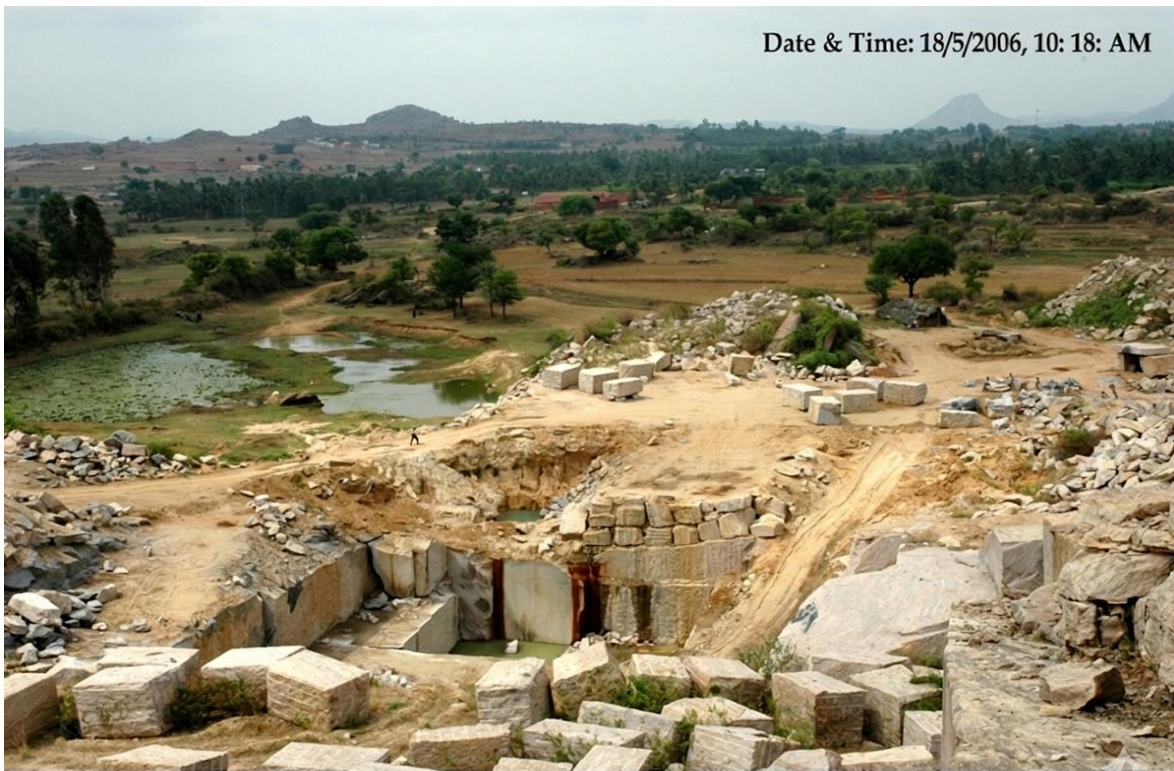
Figure 6: Overall Quarry Portion & Dumping Area of Skanda Quarry Survey no.154