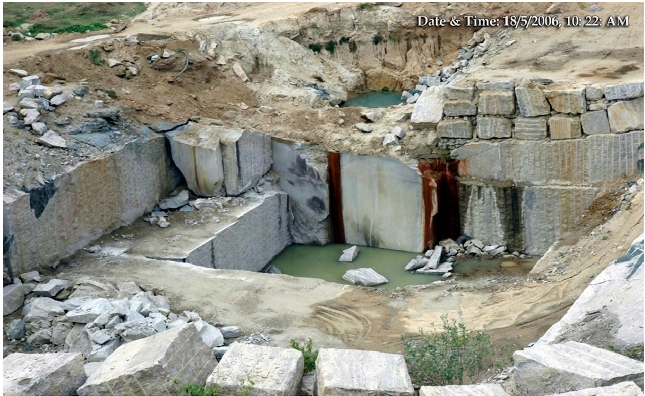
Figure 7: Pit Showing Quarry of Skanda Quarry Survey no.154