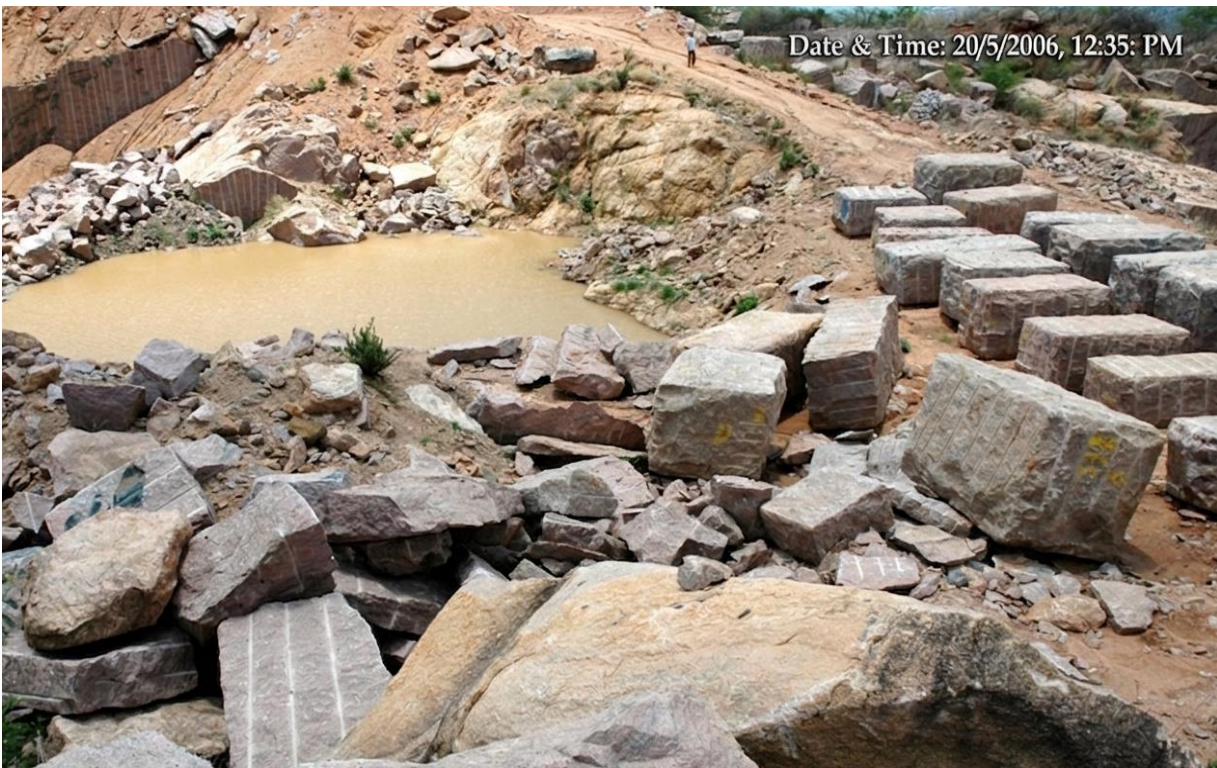
Figure 12: MML, Sy#42, of Nidagallu Site #2, Within 100 mts, Blocks & Dumping, Active