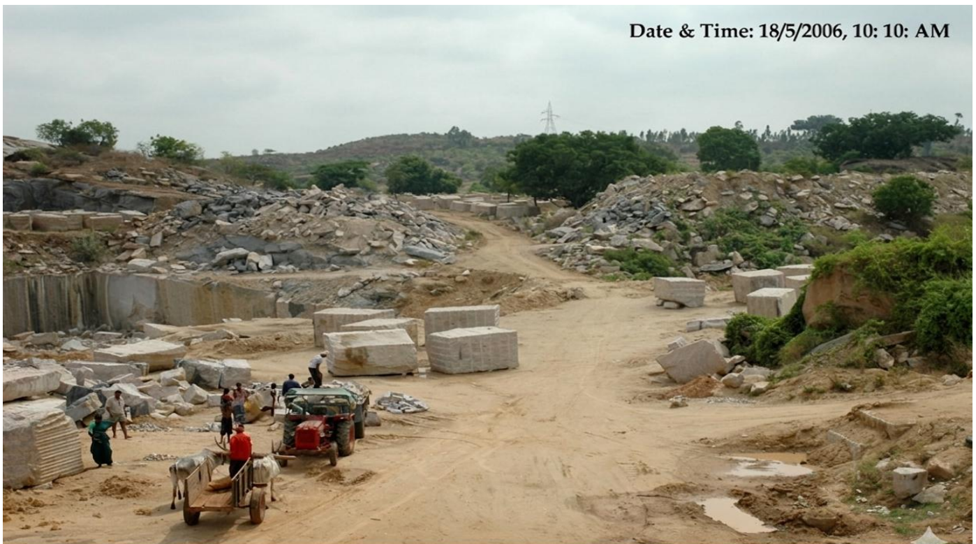
Figure 4: D.line Passes Through The Quarry Skanda Quarry Survey no.154