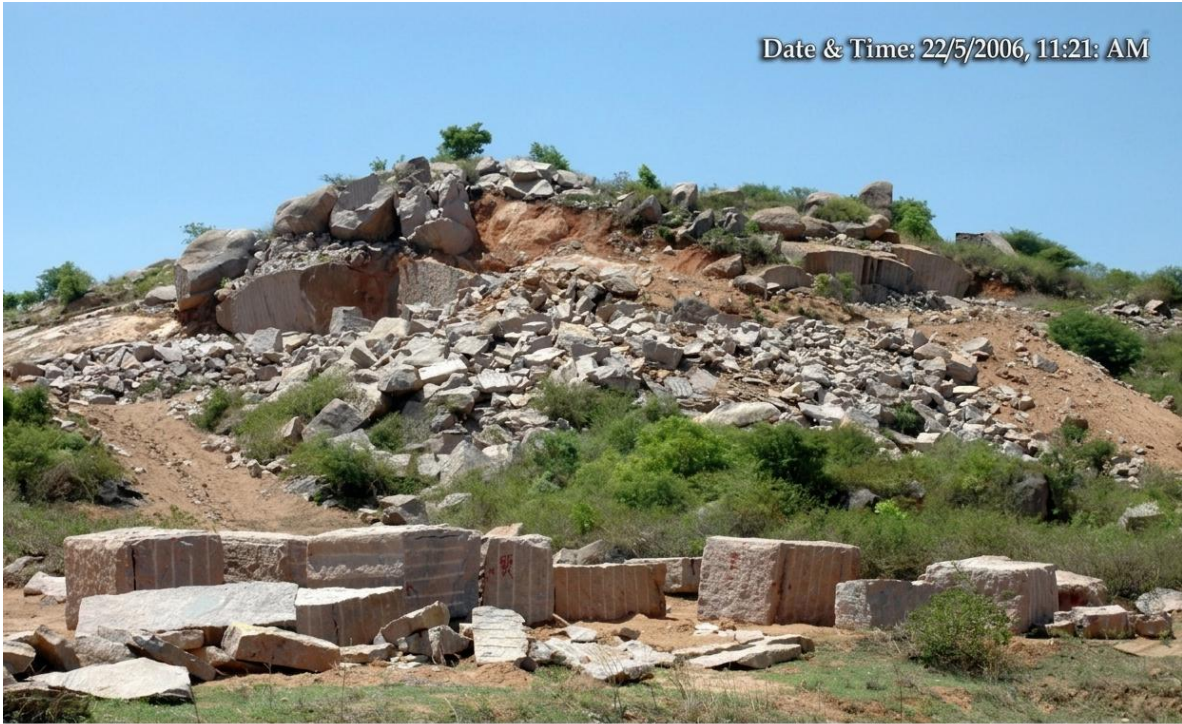
Figure 19: Kunoor Sy# 303 & 304, Soni Granites inside Arkavathi M/f Overall view of Quarry Blocks & Dumping ( Active)