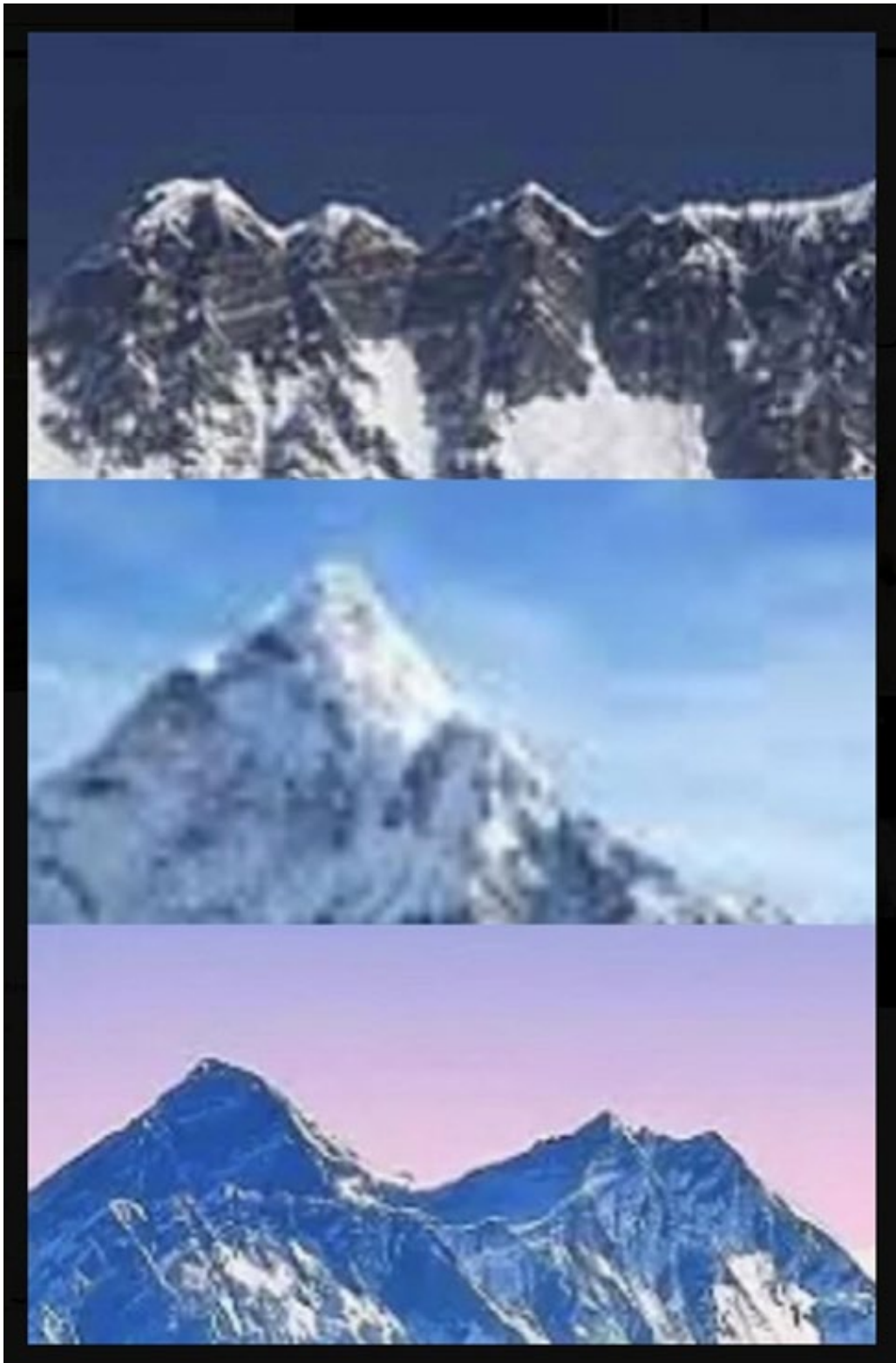
Figure 1: Himalaya shape, Grand Canyon shape, Twin Peaks shape (from Google photos)

Figure 1 shows Himalaya shape, Grand Canyon shape, and Twin Peaks shape (from Google photos)