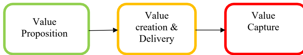
Figure 1: Basic Elements of Business model Source: The Business Model, Richardson et al [17] .