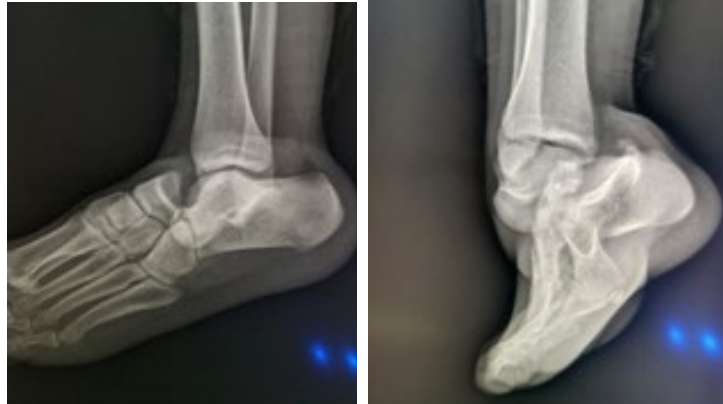
Figure 6: X-ray of the ankle showing a medial subtalar dislocation

the ankle and without associated lesions, followed by mobilization with a circular cast to be kept on for 8 weeks, followed by active and passive rehabilitation, with satisfactory results for the patient