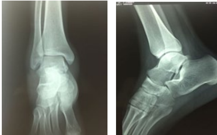
Figure 4: Post-reduction radiograph: alignment of anatomical landmarks without associated lesions

the head of the talus allowed for a smooth reduction Post-reduction radiographs showed normal and stable alignment of the subtalar and talonavicular joints, without osteochondral damage (Fig. 4)