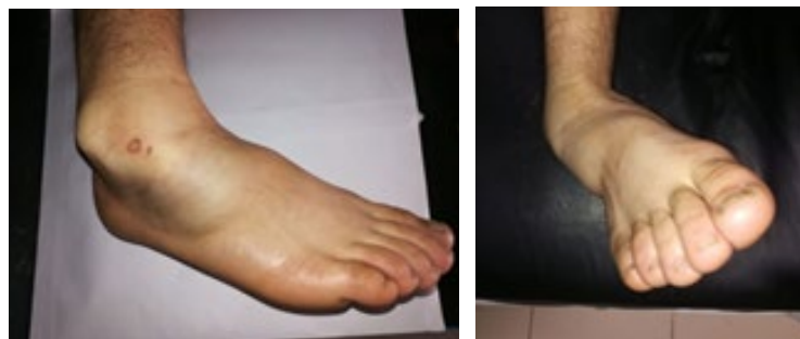
Figure 5: Clinical Aspect of A Medial Subtalar Dislocation

graze under external malleolar (Fig. 5), the vascular and nervous examination is without particularity, the radiological assessment to objectify a medial subtalar dislocation without other bone injuries, (Fig. 6)