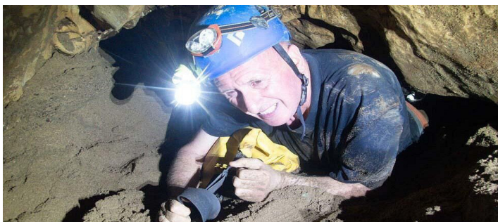
Vern Unsworth in a cave.

When it was realised that the group had not returned and their abandoned bicycles were found outside the cave entrance, the alarm was raised. A British caver, Vern Unsworth who lived in Thailand was by chance intending to visit the caves the next day and he advised the Thai government. Vern knew these caves.