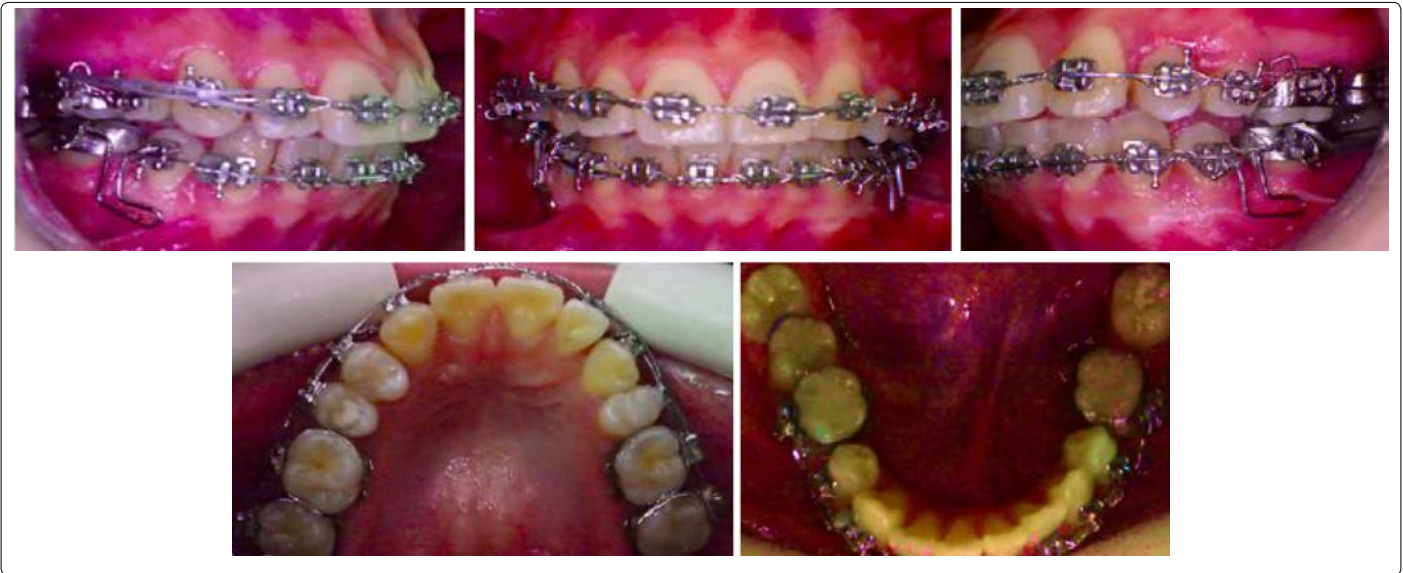
Dela Rosa at 24 Y OLD (Before)