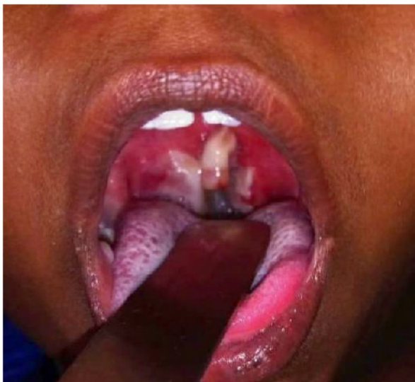
Figure 3: Image pseudomembrane in oropharynx.