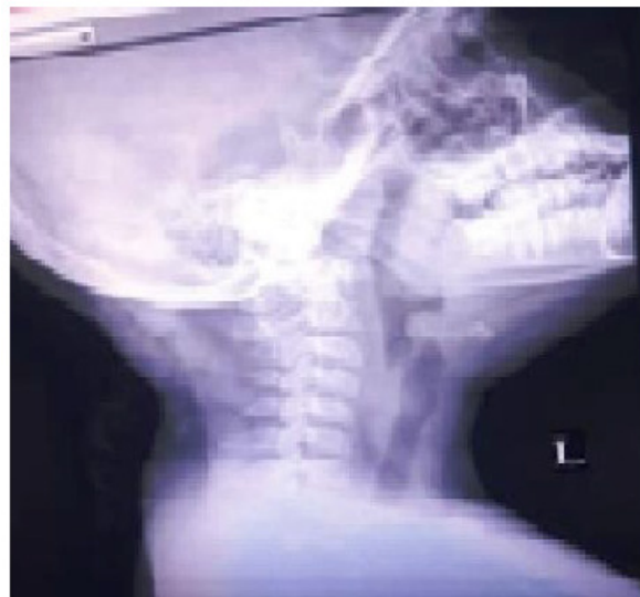
Figure 4: X-ray soft tissue neck