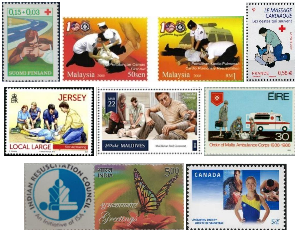
Figure 2. Learning The Technique of a Closed Massage of The Heart and Artificial Respiration

The ability to properly dress up, stop the bleeding, carry out the immobilization of the damaged limb, also, boldly, can be attributed to the vital practical skills to provide emergency and urgent preference to which everything must be owned, without