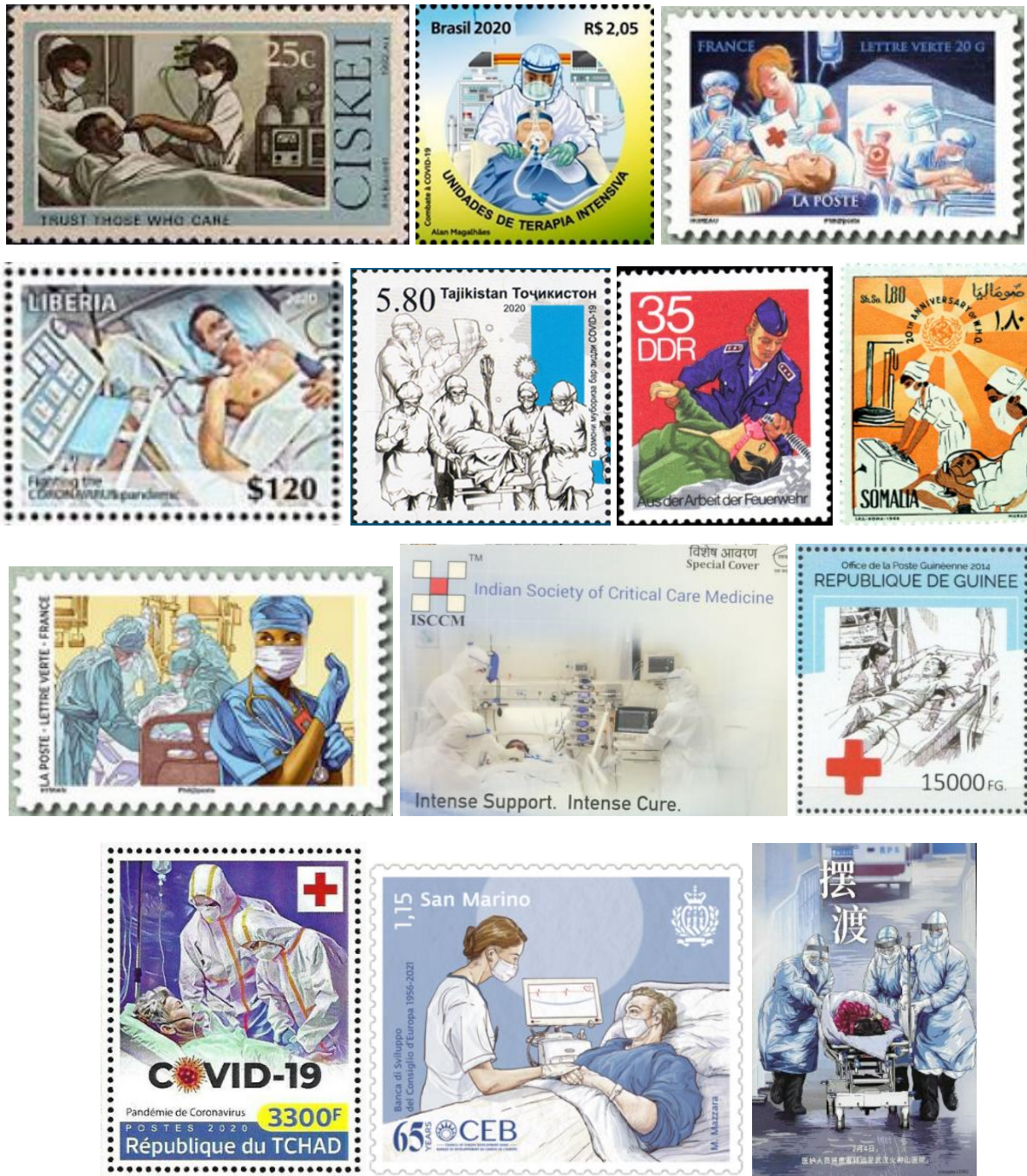
Figure 1: The Provision of Resuscitation and Conducting Intensive Therapy, In the Reflection of Philately

In order for the representatives of salvation services and ordinary categories of citizens to be able to conduct a cardiovascular resuscitation, using artificial respiration and a closed heart massage, it is necessary to conduct their qualified training, involving the training process of highly qualified specialists, from