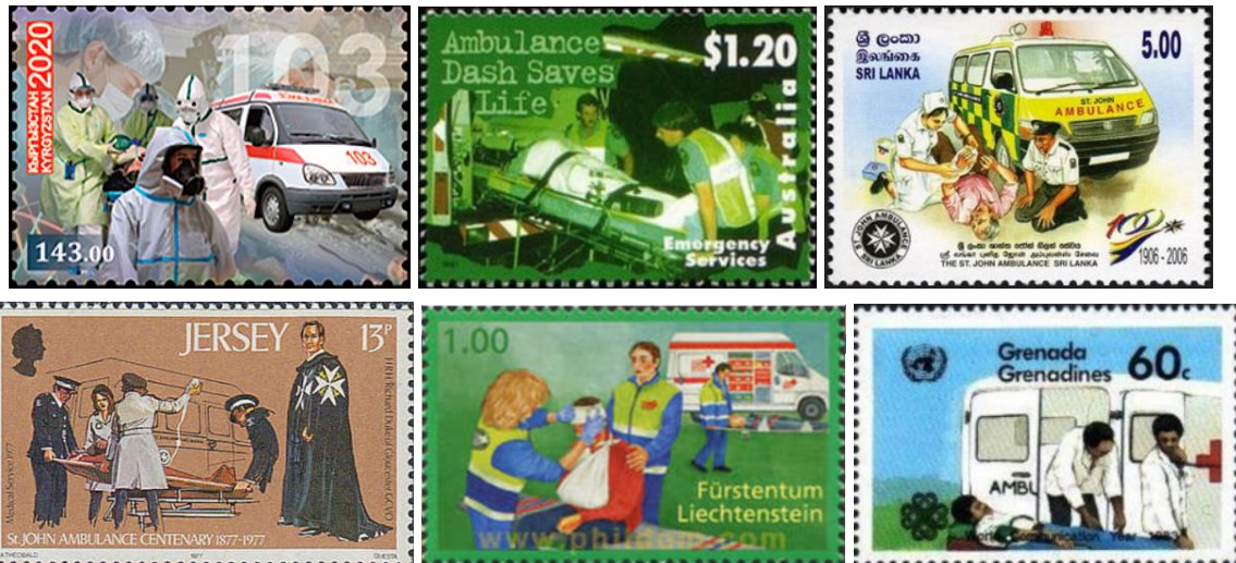
Figure 3: Dressing And Immobilization on Postage Stamps

In fig. 4, presented, in the obverse and reverse, a small selection of commemorative, silver and bronze medals dedicated to the light-hearth resuscitation of patients in a critical condition [6, 10, 12].