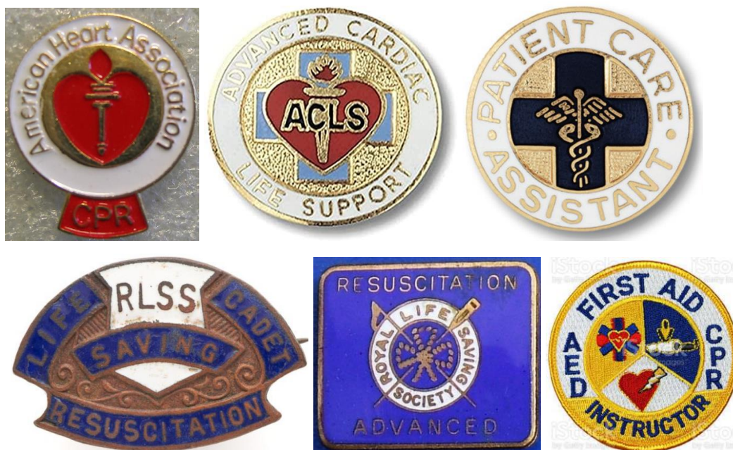
Figure 5. Commemorative badges dedicated to resuscitation and intensive care

This completed an article on providing patients with resuscitation activities, first medical and emergency medical care.