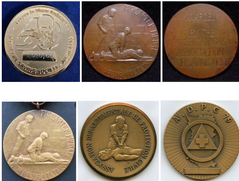
Figure 4. A Selection of Commemorative Medals Dedicated to Light-Hearted Resuscitation

In fig. 4, presented, in the obverse and reverse, a small selection of commemorative, silver and bronze medals dedicated to the light-hearth resuscitation of patients in a critical condition [6, 10, 12].