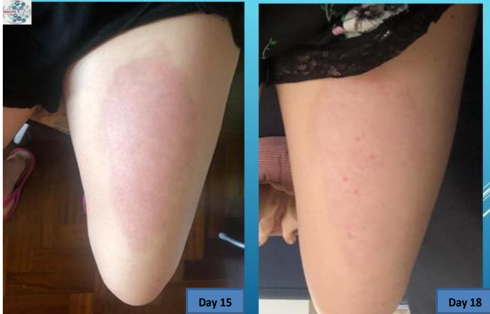
Figure 2: Complete healing, elastic skin, without scars

In the evaluation of the final skin inspection, a valid quality of the scar was found, showing an effective tensiometric strength.