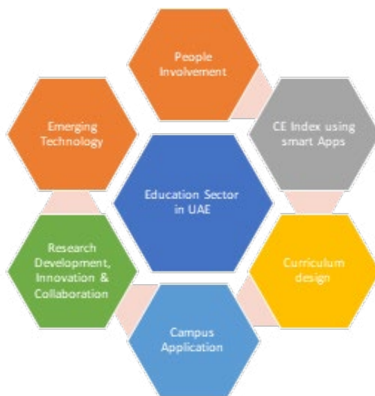
Figure developed by the Author

The measurement index of CE should include indicators that consider technological cycles with a Life Cycle Thinking (LCT) approach and their effects on environmental, economic, social, actual implementation reality dimensions of the identities, can be applied to organization and individual. The CE index can support the tracking of the projects and measure the progress in CE by the Organizations and even individuals (De Oliveira et al., 2021).