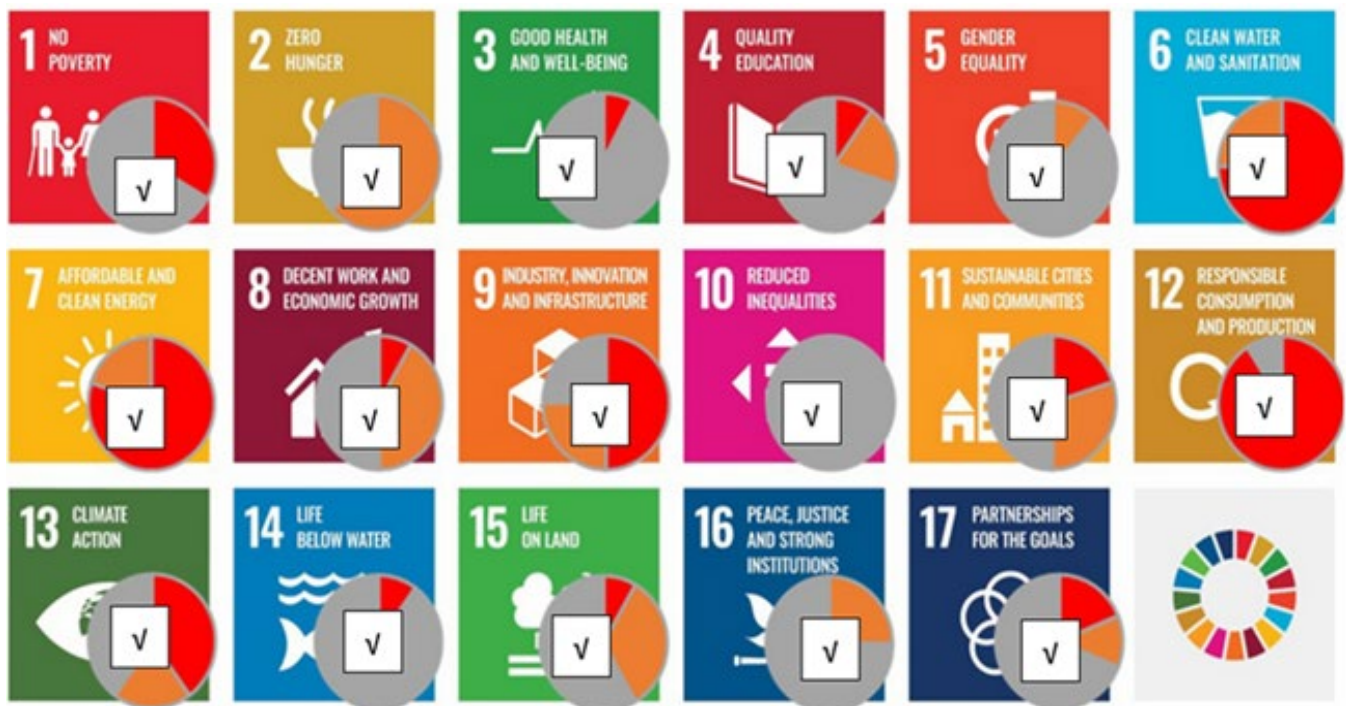
Figure developed by the Author

The CE Index development can be major contribution to the area of existing knowledge and help in measuring the Organization's current initiatives on a standardized scale compared to the other Industrial initiative and can make suggestions to implement more projects. The Index will induce competitiveness among the various Organizations and help the cause of CSR and CE (Upadhyay et al., 2021).