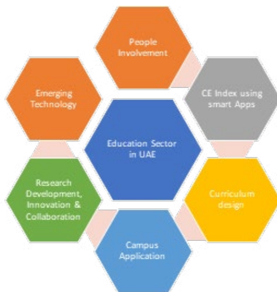
Figure developed by the Author

The measurement index of CE should include indicators that consider technological cycles with a Life Cycle Thinking (LCT) approach and their effects on environmental, economic, social, actual implementation reality dimensions of the identities, can be applied to organization and individual. The CE index can support the tracking of the projects and measure the progress in CE by the Organizations and even individuals (De Oliveira et al., 2021).