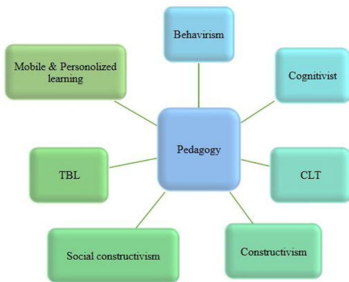
Figure 1: Pedagogical Developments of CALL