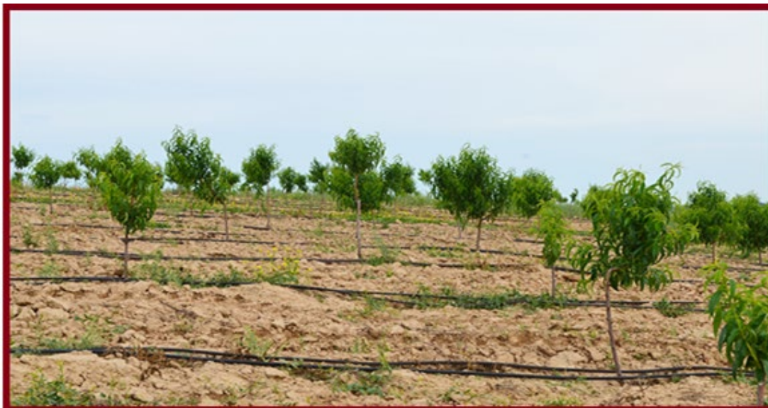
Figure 3: Demonstration of the Micro-Irrigation Regime Using Drip Irrigation of Fruit Trees in the Conditions of the EIA of the Research Institute of Erosion and Irrigation in the Shamakhi district in the village of Malkham.