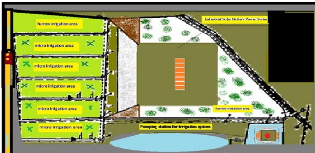
Figure 2: Scheme of the Irrigation Sprinkling Station on the Experimental Part of the Terter RACS in the Garabagh land in the Period 2006-2010 with the use of the Idad and MDR sprinklers

Where, irrigation was conducted in this period with an irrigation rate of 3800-4200 m 3 / ha. Further all this work was expanded in the Samukhian area of corn on the trees and mulberry trees, in the Shamakhi district in vineyards, in the Guba district of fruit gardens, Khachmas district of vegetable crops (cabbage, eggplant). Studies on sprinkling in this facility have shown that the rainfall in the IDAUD (3 mm / min) is greater than the rate of water absorption into the soil of the research object. Therefore, when feeding 500 m 3 / ha, puddles and surface discharges were formed at the site.