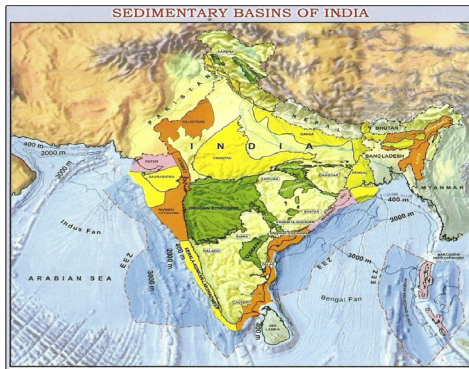
Figure 1: Sedimentary Basin of India

In 1993 also author has discovered the occurrence of natural Petroleum gas in the Borewell of Sri Tiwari in Rahatgarh who is continuously using this gas for his daba/ hotel on way to Bhopal the state highway. In this well also after drying of the well hag started pouring the air/ petroleum gas, which is in continuous using for the hotel chulha.