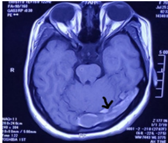
Figure 1: showing right sixth cranial nerve palsy and figure 2: MRI of brain showing cord sign.(black arrow)