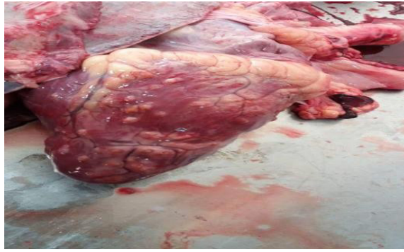
Figure (2): Cattle heart show multiple cysts by C. bovis

Referring to the records of the affected parts with cysticercosis (Table 6) displayed that 25, 18 and 2 hearts of cattle during 2017, 2018 and camel during 2018, besides, 3 and 2 heads of cattle during 2017 and 2018. Only one cattle carcass's total condemnation during 2017. The total economic losses was 32,940 LE along the investigation period (Table 7).