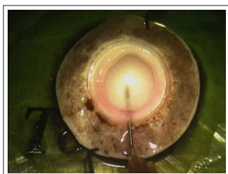
Figure 1: Type 1 bubble

With the injection of air or BSS two kinds of bubbles may be obtained, as cited in previous publications [3,4]. The type-1 BB ( Figure 1 ) is formed when the separation occurs between the posterior corneal stroma and PDL. Generally, it occurs in approximately 80% of cases after pneumodissection [5]. The formation of a type-1 BB starts in the center and further expands towards the periphery, with an average diameter of 7.0 to 8.5mm [3]. When this type of bubble occurs, the graft obtained consists of endothelium, DM and PDL. After bubble formation, the graft was removed with the use of a trephine and if required, gentle scissor cuts. On the other hand, formation of a type-2 BB ( Figure 2 ) starts at the corneal periphery and expands centripetally. This latter type of bubble separates PDL and DM, thus the graft lamella consists of only endothelium and DM [3]. It is interesting to note that there is a possibility of simultaneous formation of type-1 and 2 BB. Whenever a type-2 BB or simultaneous bubbles were obtained, the surgical technique was converted to DMEK.