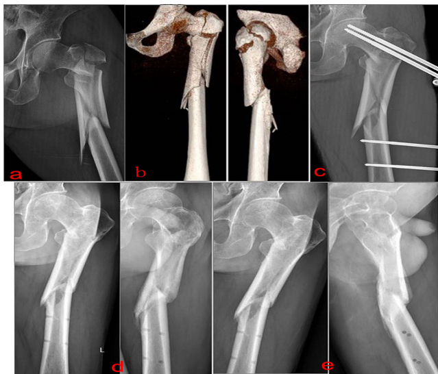
Figure 1: A 77-year-old male, AO type 31 A3.3. a. Preoperative anteroposterior X-ray; b. Preoperative 3-D CT scan; c. Immediate postoperative anteroposterior X-Ray; d.6 months post-operative anteroposterior and oblique X-ray, patient full weight bearing;

The quality of the final reduction was rated as good in 60% of patients (9 patients), acceptable in 27% (four patients), and poor in 13% (two patients). This result was mainly attributed to an increased incidence of varus position of the fracture (greater than 10°) in these unstable fractures of patients (Figure 1). Besides, slight convergence of the proximal screws was noticed in 33% of patients.