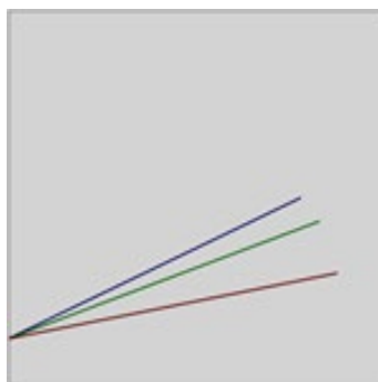
Figure 3: Regge trajectories for different quark-antiquark mesons

Hadronic resonances observed in collider experiments as well as computer simulations results show that so called Regge trajectory values \alpha(i) for quark- antiquark mesons look like: