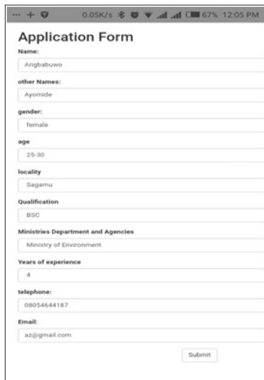
Figure 1: Mobile app for prospective job seekers