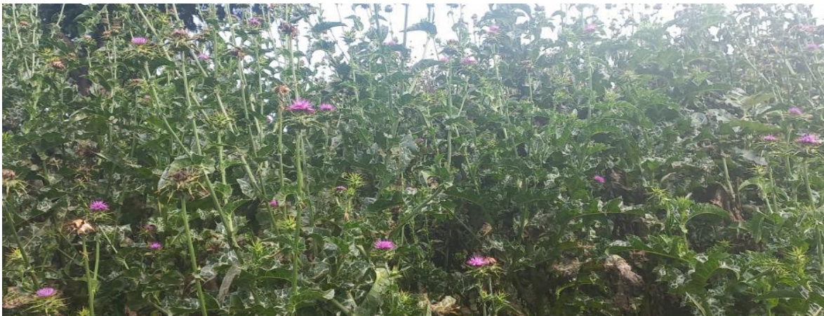
Figure 3: Dense stands of S. marianum in urban green areas, Addis Ababa

The current study confirmed the presence of S. marianum in all the surveyed urban green area sites with varying from newly outgrowth to very spread out status. The wide distribution of the weed in the city suggests its presence in the city for a longer time than anticipated, the suitable habitat and the presence of efficient dispersal mechanisms. In Addis Ababa city, there are various identified and unidentified invasive weeds have been grown as major and minor invaders across roadsides, waste places, river sides, plantations, and urban green areas during this assessment. The majority of invasive weeds are growing along roadsides.