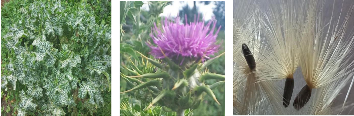
Figure 2: Leaf, flower and seeds of Silybum marianum

cause for seed dispersing to the new habitats/ areas.