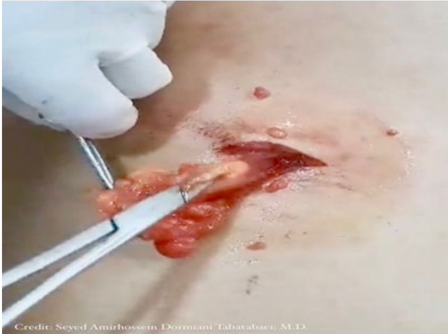
Figure 4: The excisional biopsy of a subcutaneous lipoma located on the back of a 41-year old woman. The patient complained of swelling and itching over the upper trunk around the site of mass. Intraoperatively, the lobulated tumor was found to resect completely. Eight months after resection, there was no recurrence.

Liposuction and lipolytic injection therapies are used in the management of lipomas [53]. Employing injections of Prednisolone (a corticosteroid agent) and isoproterenol (a \beta -2 adrenergic agonist agent) in combination is also a modality of treatment that induces the lipolysis and decreases superficial subcutaneous lipoma's volume by 50% over 4 weeks in addition to the ease of post-injection surgical removal [54]. Furthermore, intralesional phosphatidylcholine and deoxycholate have been employed to shrink tiny lipomas [55, 56].