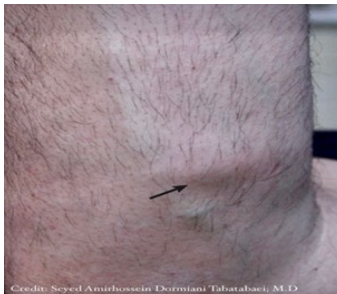
Figure 2: A 39-year-old man presented with a subcutaneous lipoma on the lateral side of the left forearm (the arrow). The mass, was mobile with respect to the over-lying skin but fixed to underlying structures.

basis of diagnosis. Lipomas oftentimes present as a soft non-tender mass as illustrated in Figure 2.