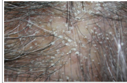
Figure 4: Lichen Planu-pilaris Lichen plano-pilaris [Fig4] and lichen planus of nails [Fig.5] are important for their probable complications of scarring alopecia and loss of nails respectively.

The erosive type of oral LP [Fig.3] is very painful and may cause difficulty in eating.