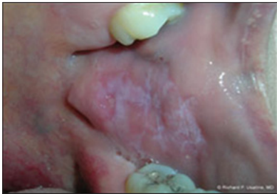
Figure 1: Oral LP Some variants of LP may cause considerable discomfort.

In general, spontaneous remission of cutaneous LP after one year occurs in 64% to 68% of patients [11]. Cutaneous LP with involvement of mucous membrane [Fig.1] persists longer. The reported mean duration of oral LP is about 5 years, while the erosive form of oral LP may not spontaneously resolve.