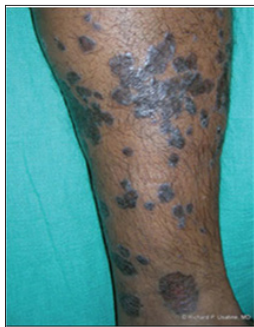
Figure 2: Hipertrophic LP Hypertrophic LP [Fig.2] is more pruritic than the usual cutaneous LP.