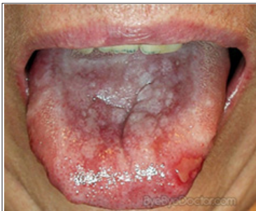
Figure 3: Oral erosive LP

The erosive type of oral LP [Fig.3] is very painful and may cause difficulty in eating.