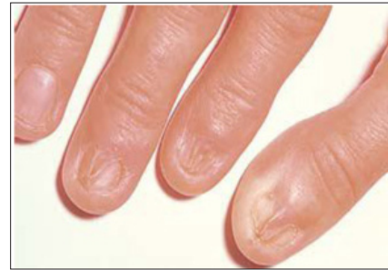
Figure 5: Nail LP

More aggressive forms of treatment are needed for the following variants of LP---