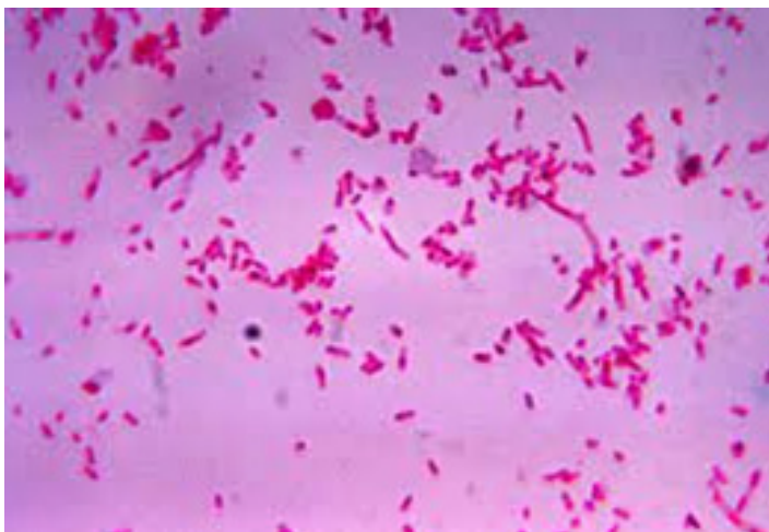
Figure 1: Gram staining of neck collection showing fusiform gram-negative bacilli ( Fusobacterium necrophorum )

peared erythematous. On respiratory system examination, she had good air entry bilaterally without wheezes or crackles. Laboratory tests showed neutrophilic leukocytosis (white blood cells count 16.26 \times 10^9/L , neutrophils 87%), and elevated C-reactive protein (135.9mg/dL). An unexpectedly high procalcitonin value (29.4 ng/mL) raised the suspicion of bacterial sepsis. Other lab reports were normal: creatinine was 1.03mg/dl, glucose 105mg/dl, albumin low at 2.6, sodium 138 mmol/L, potassium 3.7mmol/L, and alanine aminotransferase (ALT) 30U/L. The chest radiograph showed a right perihilar infiltrate. After drawing blood culture (aerobic, anaerobic culture was not available), an empirical treatment with meropenem was started. Two days later, the patient was still febrile and mildly lethargic, with toxic appearance. Blood culture failed to reveal growth of any organism. A neck ultrasound was performed, showing multiple enlarged cervical lymph nodes, bilateral peritonsillar multiloculated enhancing fluid collections. It also showed punctate foci within the right internal jugular vein, which was thought to represent partial thrombosis. Surgical debridement was done and as wound swab gram stain showed Fusobacterium necrophorum , an anaerobic gram-negative rod in Figure 1, intravenous clindamycin was added to meropenem.