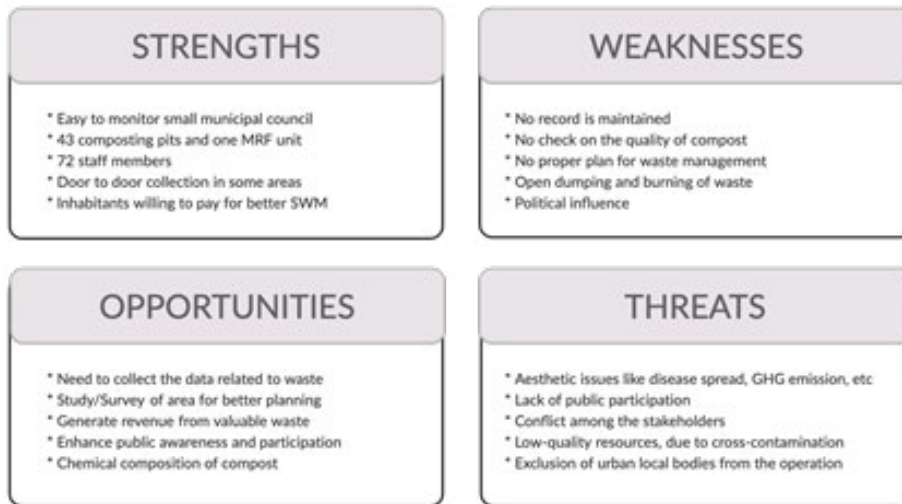
Figure 2: SWOT analysis of WM in MCD

There is no proper record maintained by MCD. The data operator in the form of hard copies records all data manually, and by observing the figure, it was quite clear that the data is completely manipulated just to meet the guidelines issued by GOI. So, the assumed data is used as per standard waste generation value and the state wise data available at different online sites and research articles. The quantitative analysis is performed on numeric data collected from various primary and secondary locations. The qualitative analysis is further expressed and explained in narrative form based on interview, small group discussions & responses collected in structured questionnaire survey from samples selected in the categories: low, middle and high-income localities.