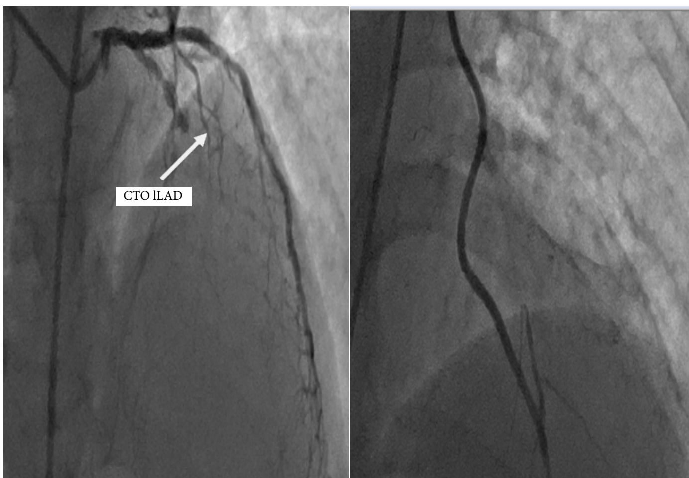
Figure 1: Pre and post procedure with LIMA CTO LAD

one case of HCR was described this patient presented with acute AWTMI coronary anatomy showed ostial LAD with short left main underwent LIMA to LAD and long lesion with 99% RCA EF 40% procedure was uncomplicated hospital stay was 8 days Pic of HRS (123).