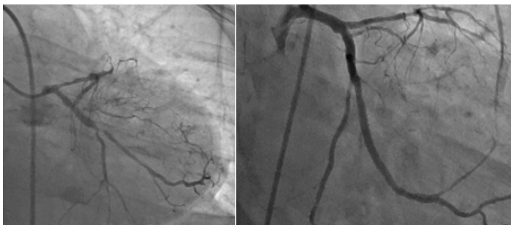
Figure 3: Pre and Post Staged PCI OF LCX