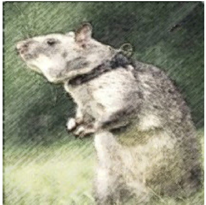
Figure 5B: The Gambian rat ( Cricetomys gambianus ) [African giant pouched rat]

One patient reported a contact with an ill rabbit (Family Leporidae) that had a contact with ill prairie dog at a veterinary clinic. In Illinois, the prairie dogs were housed with Gambian giant rats.