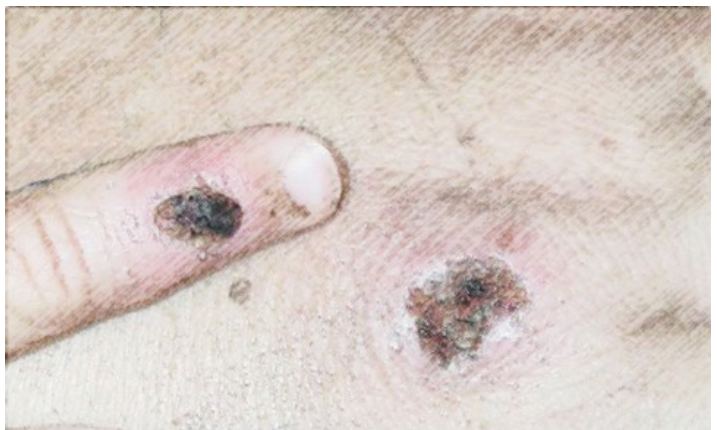
Figure 6C: Thereafter, the rash progress to the crusting stage

The incubation period of human monkey pox is 12 days (7 to 17) days and the symptoms typically continue for 2 to 4 weeks. Human-monkey pox can be transmitted to humans by an animal