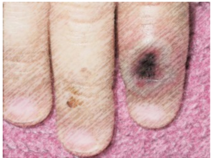
Figure 6B: The initial papular rash changes to a small pox-like vesicular and pustular rash