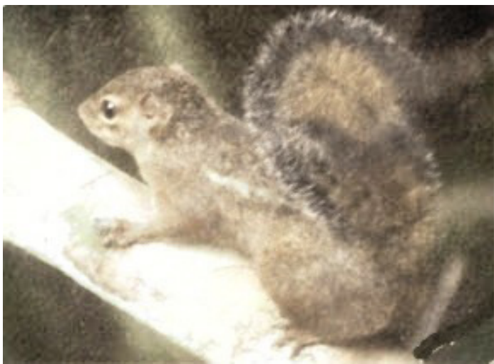
Figure 4: Thomas's rope squirrel or redless tree squirrel ( Funisciurus anerythrus ), a species of rodent (Sciuridae family)

Khodakevich et al (1987) reported an environmental study of human-monkey pox conducted in northern Zaire during July, 1985. Isolation of monkey pox virus from the squirrels Funisciurus anerythrus (Figure-4) suggested that the virus can circulate even in the absence of larger animals including primates, and thus can contribute to the transmission of the virus to humans [6].