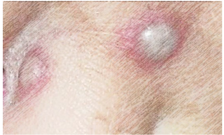
Figure 6A: Within one to three days of the beginning of human monkey pox disease, an early papular rash appears

Various stages of the rash can be seen at the same time on the face, head, trunk, and limbs.