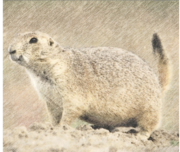
Figure 5A: Black-tailed prairie dogs, Cynomys ludovicianus species are commonly used as pets

contact with prairie dogs ( Cynomys sp.). Prairie dogs belong to the squirrel family "Sciuridae" Black-tailed prairie dogs, Cynomys ludovicianus species (Figure-5A) are commonly used as pets. One patient had contact with a Gambian giant rat ( Cricetomys sp.) (Figure-5B).