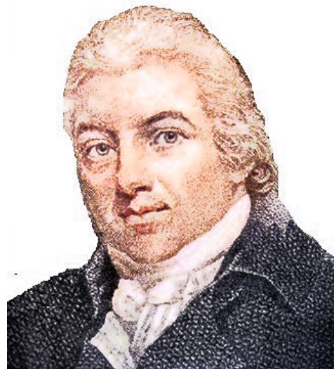
Figure-1A: Edward Jenner (May, 17, 1749-January, 26, 1823), a British physician

In 1796, Dr. Edward Jenner (Figure-1A) used cowpox virus instead of smallpox virus in Britain and contributed to the decline of smallpox infections in Europe and North America only. In January 1967, the World Health Organization launched the global eradication program of smallpox which was achieved during October 1977, and the last patient in the world affected by small pox recovered from this disease in Somalia (Figure-1B) [5, 6].