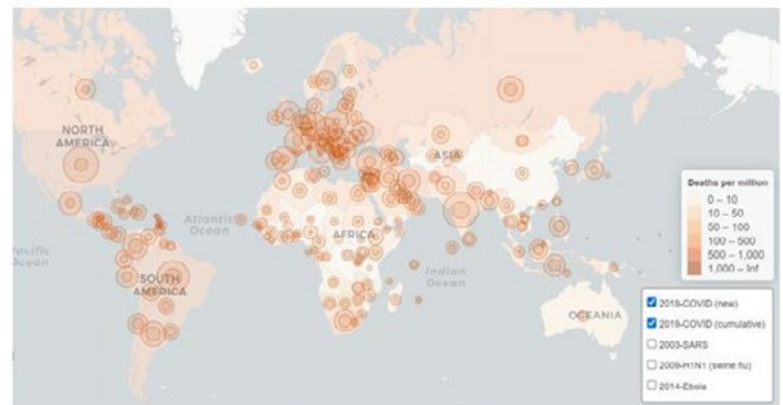
Figure 2: Changes around the world regarding the pandemic (figure adapted from: https://vac-lshtm.shinyapps.io/ncov_tracker/ ).

infection, including the Miller-Fisher syndrome variant; from case series; as well as letters to the director or to the editor, through which it is not possible to establish strong evidence of a causal relationship given the absence of any type of statistical analysis, even more so considering the high prevalence (cumulative incidence in June 2021 of more than 170,000,000 cases worldwide) of SARS-COV2 infection in the areas where these cases occurred (Figure 2), thus not being able to rule out the hypothesis that it was actually a simple coincidence of two relatively frequent pathologies [4, 19].