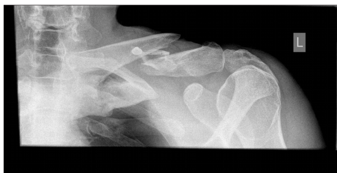
Figure 1: Loss of lung markings on left side along with clavicular fracture

As a routine policy, this patient's x-ray was reviewed by a radiologist on the same day and reported a fracture clavicle along with a left pneumothorax (Fig. 1: Loss of lung markings on left side along with clavicular fracture).