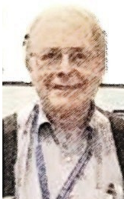
Figure-1C: David Owen Silence, a Geneticist from Australia

In 1979, David Owen Silence (Figure-1C) from Australia and his colleagues emphasized the genetic heterogeneity of Ekman-Lobstein syndrome, and reported a genetic epidemiological study which showed that there are at least four distinct types of syndrome. The autosomal dominant syndrome (Type-1) was found to be the most common and is associated with fractures and definite blue sclerae, and can also be associated with pre-senile conductive deafness.