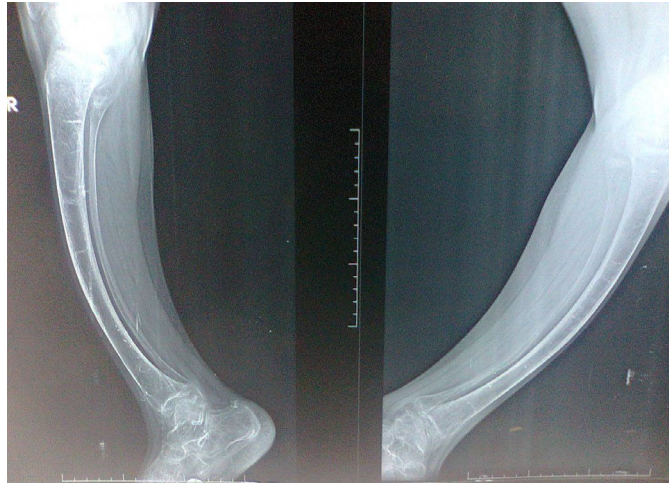
Figure-2C: Radiographs showed more severe bowing