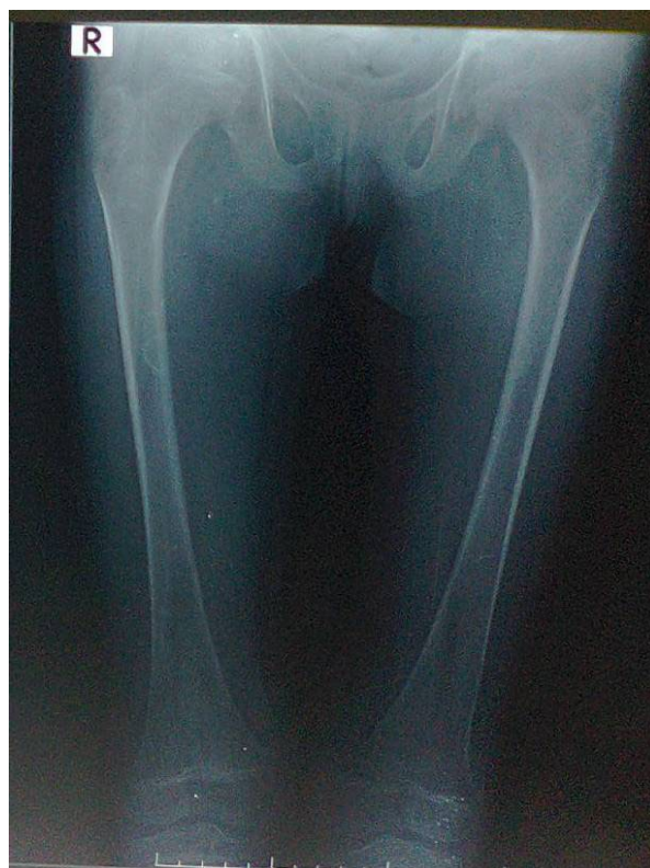
Figure-2B: A lower limb radiograph taken during December, 2019