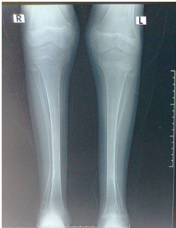
Figure-2A: A lower limb radiograph taken during December, 2019

David Owen Silence and colleagues' classification despite the inheritance seems more likely to autosomal recessive [3].