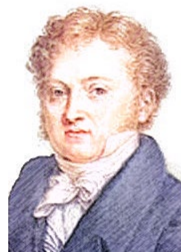
Figure-1A: Jean Georges Chrétien Frédéric Martin Lobstein (8 May 8, 1777-March 7, 1835), a German-born, French pathologist

cases with the condition observed as early as 1678. In 1833, Jean Lobstein (Figure-1A) studied the condition and differentiated it from osteomalacia. He called the disease "idiopathic osteopsathyrosis."