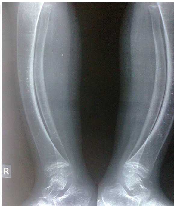
Figure-4C: Radiograph of the lower limbs showing bowing, cortical thinning with scanty spongiosa