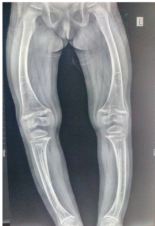
Figure-3B: lower limb radiograph showing progressive bowing