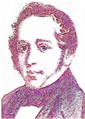
Figure-1B: Willem Vrolik (April 29, 1801-December 22, 1863), a Dutch Anatomist and Pathologist from Amsterdam

In 1849, Willem Vrolik (Figure-1B) described the condition in a newborn infant with poorly ossified calvarium, and called it osteogenesis imperfecta.