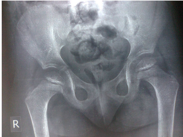
Figure-4A: Radiograph of the pelvis showing mild protrusio acetabula