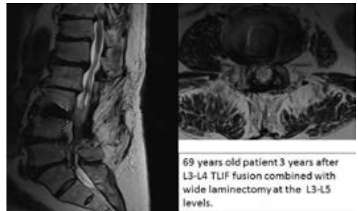
At BL patient had 18 degrees of sagittal motion, and required daily 50 mg of morphine equivalent narcotic medication.