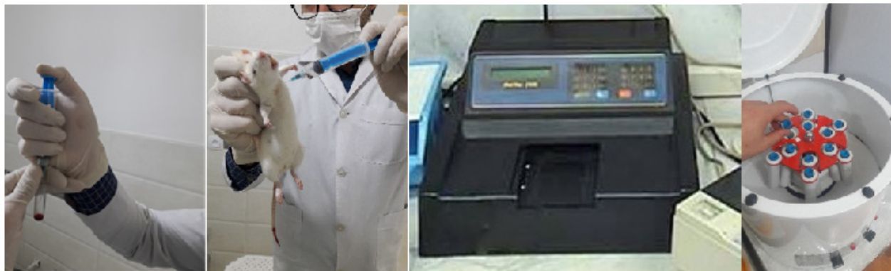
Figure 1: Blood Collection from Rat Heart, Serum Separation and Sample Analysis with ELISA Reader

lated serum was measured using the T3, T4, TSH and T3, T4 and TSH assay kits Figure 1.