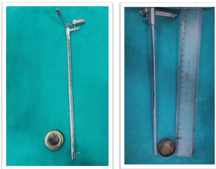
Figure 2: (A&B); Foreign Body, Metallic Container (2x2cm) With Mirror and Sharp Edge Opposite Surface.