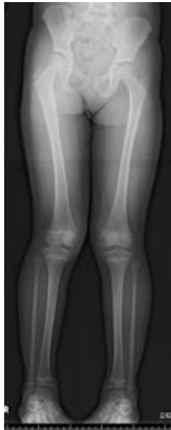
C: After two years of surgery, a leg length discrepancy of 16 mm was noted.