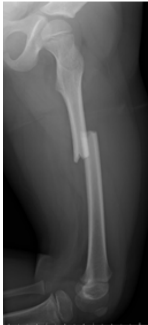
Figure 3: Case 3 sustained a left femoral diaphyseal fracture as a result of a traffic accident.