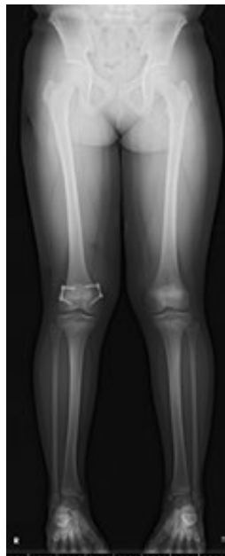
D: The leg length discrepancy was corrected with the use an 8-plate temporal epiphysiodesis.

Case 3 sustained a left femoral diaphyseal fracture as a result of a traffic accident. (Fig.3) After undergoing conservative treatment with skeletal traction, bony fusion was successfully achieved, however, a shortening deformity and leg length discrepancy of -11mm were observed at the time of fusion. Subsequently, the leg length discrepancy was reversed as a result of overgrowth,