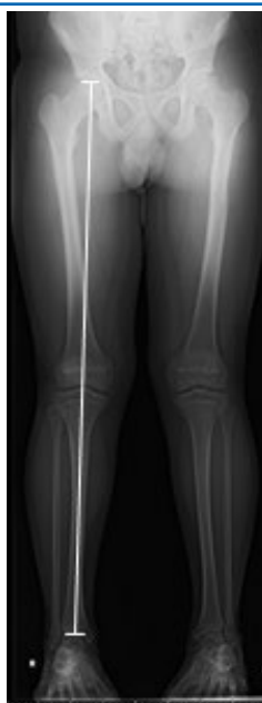
Figure 1: Whole limb length was defined as the length from the top of the femoral head to the center of the tibial plafond.

Case 1 was a 5-year-old boy and Case 2 was a 4-year-old girl, both of whom were fixed with no leg length discrepancy after anatomical realignment using Taylor spatial frame (TSF)(Smith & Nephew, Memphis, Tennessee, USA) . Case 3, a 7-year-old