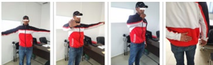
Figure 3: The Articular Amplitudes of The Right Shoulder After Six Months of Evolution