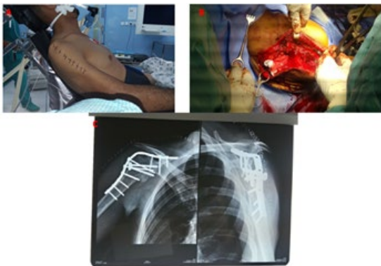
Figure 2: A : Mounting Position 30^\circ/30^\circ/30^\circ (Antepulsion, Abduction, Internal-Rotation). B: The Intraoperative Appearance After Placement of the Plate. C : Postoperative Control Radiography.