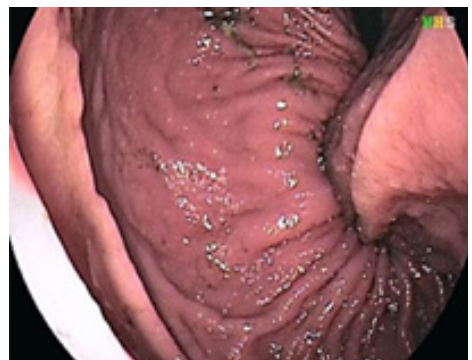
Figure 4: Endoscopy of UGIT showing large hiatus hernia with no active gastrointestinal bleeding.

On the upper gastrointestinal endoscopy, there were linear erosions at esophagogastric junction where hiatal hernia and diaphragmatic compression occurred. Active gastrointestinal bleeding was not observed (figure 4).