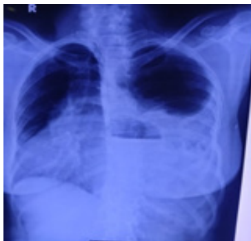
Figure 1: Plain radiography in the upright position showed a slightly enlarged heart size with a parenchymal opacity visualized in the left lower lobe, which partially silhouetted the left hemi diaphragm and obscured the cardiac apex. There is also retro cardiac gas fluid level.

On chest radiograph posterior anterior view there was increased cardiothoracic index, enlarged mediastinum, and a mass appearance with an air-fluid level superposed with cardiac contours were observed (Figure 1).