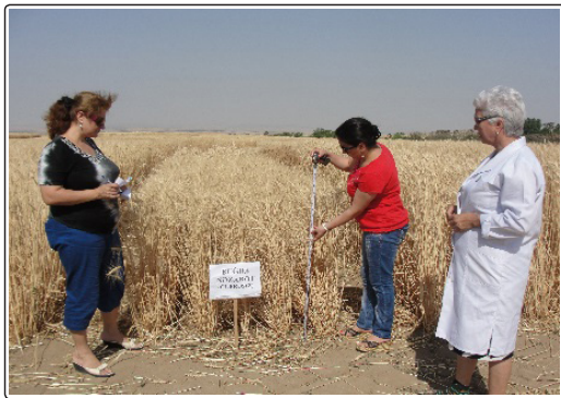
Note: Piping phase 06.07. 2019

Therefore, the normal development of agricultural crops cultivated in those lands is disrupted, resulting in low quality products. Various agro-technical measures have been effectively utilized to bring such lands into good condition and to improve their lost fertility. As a visual manifestation of this, it is possible to satisfy the biometric measurements and phenological observations on the plant with the experimental variant, as a result of the prediction of the research we have undertaken under the sowing plant in the Shamakhi region of the region [3,4].