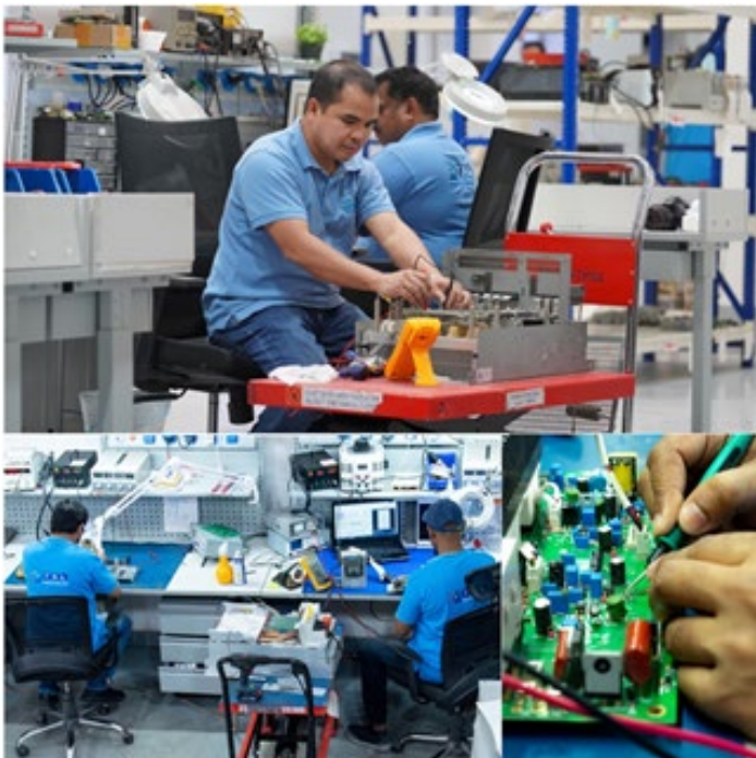
Figure 1: The facility to remanufacture

The facility will receive many different units and some of those units are similar to Fig 2 which is from sectors like Oil & Gas, Water & Energy. This facility will remanufacture more than 1,000 units a year for the Middle East.