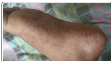
Figure 1: Showing rash over sole

A 4year Old, Previously healthy male Child was admitted to Government Hospital, Kurnool with history of fever for 10 days, rash for 5 days, loose stools and altered sensorium on the day of admission. There is no history of significant tick/flea bite. The maculopapular type of rash was over the face, both extremities including palms (Figure 1) and soles and over abdomen (Figure2).