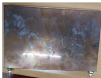
Figure 7: Stainless steel rectangular (300mm x200mm x 20mm) filled with our materials

After a certain period of time has elapsed, the surface temperature in Figure 8 reached 1100°C, the temperature of the internal coil was 1120°C, the temperature inside the stainless-steel heater stick surrounding the coil was 750°C, the surface temperature of