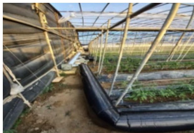
Figure 12: vinyl greenhouse (2,079m 2 ) with test equipment using our MEGA-STN