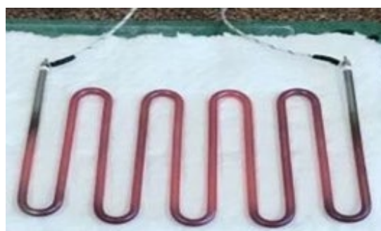
Figure 3: AC 3.2 kW (50/60 Hz)

less steel heater stick. (Figure 3) shows a 3.2 kW stainless steel heater stick, and its surface temperature change was expressed in 150°C~320°C when supplied with electricity. Through several experiments, Figure 3 shows that the maximum surface temperature does not exceed 320°C. At this time, the temperature of the internal coil was 1120°C, and the temperature inside the stainless-steel heater stick did not increase any further at 800°C. After a certain period of time, our materials inside the stainless-steel heater stick started to burn, and its surface temperature increased to 320°C and began to drop gradually to 150°C. Additionally, we supplied 3.2 kW of electricity continuously to the stainless-steel heater stick, but there was no longer a surface temperature change. After a certain time, the stainless-steel heater stick stopped working with no further change in heat. At this time, the internal coil was cut off from the inside, and our materials inside were burned and blackened.