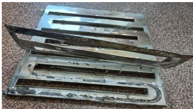
Figure 17: Stainless steel rectangular plate (500 mMx400 mMx30 mM) filled with our materials of MEGA-STN , which is with the stainless steel heater stick (AC 4Kw, 50/60 Hz).

melted, and it did not work anymore as shown in Figure 18. This means that the inner temperature of Figure 17 is quite high given that the melting point of the stainless steel is generally 1375°C~1530°C.