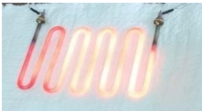
Figure 9: stainless steel heater stick (AC 4Kw, 50/60 Hz)

We made three 4Kw stainless steel heater sticks added 50% of materials of MEGA-STN as shown in Figure 9. The surface temperature of it went up to a maximum 700°C. We made a stainless-steel rectangular plate (500 mMx400 mMx30 mM) with the air holes as shown in Figure 10. Figure 10 is the one with a stainless-steel heater stick (AC 4Kw, 50/60 Hz) of Figure 9 fixed in the stainless-steel rectangular plate and materials of MEGA-STN in the remaining space of it. The surface temperature of it went up to a maximum 950°C. We made an equipment as shown in Figure 11. We put three stainless steel rectangular plates of Figure 10 in the equipment of Figure 11 and two fans. As shown in Figure 11, a fan located on top of the equipment pushes the wind in and a fan in front of it pulls the wind out. This is the way to emit positrons by passing the wind through three stainless steel rectangular plates of Figure 10 in the equipment of Figure 11.