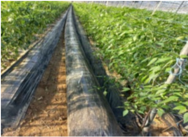
Figure 13: 80 meters long and 300π whole vinyl