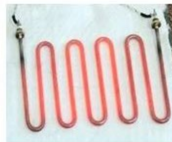
Figure 4: AC 1.5 kW (50/60 Hz)