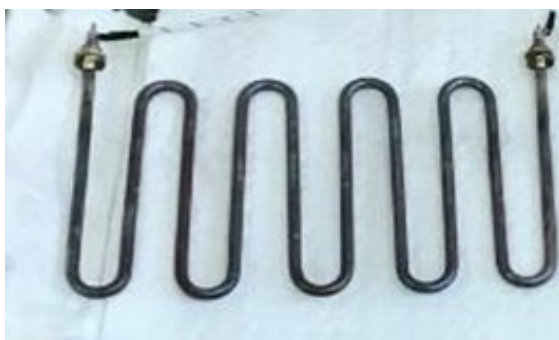
Figure 2: AC 1.5 kW (50/60 Hz)

We present the following methods with the existing stainless-steel heater stick to prove the effectiveness of materials of our MEGA-STN. We experimented with the temperature change and durability with the existing 1.5 kW stainless steel heater stick. (Figure 2) below is a 1.5 kW stainless steel heater stick, and its surface temperature change was expressed in figures of 120°C~180°C when supplied with electricity. Through several experiments, Figure 2 shows that the maximum surface temperature does not exceed 180°C. At this time, the temperature of the internal coil was 1020°C, and the temperature inside the stainless-steel heater stick did not increase any further at 600°C. After a certain period of time, our materials inside the stainless-steel heater stick started to burn, and its surface temperature increased to 180°C and began to drop gradually to 120°C. Additionally, we supplied 1.5 kW of electricity continuously to the stainless-steel heater stick, but there was no longer a surface temperature change. After a certain time, the stainless-steel heater stick stopped working with no further change in heat. At this time, the internal coil was cut off from the inside, and our materials inside were burned and blackened.