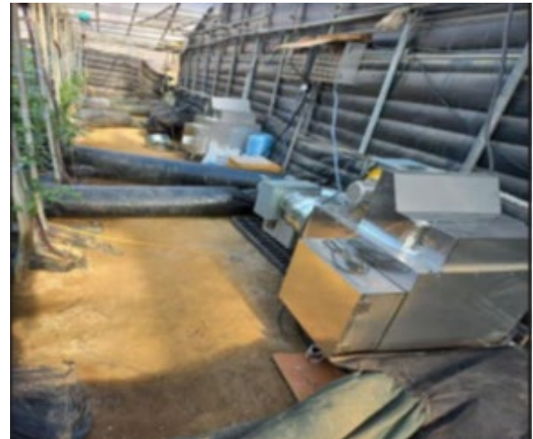
Figure 14: 100 meters long and 500π whole vinyl