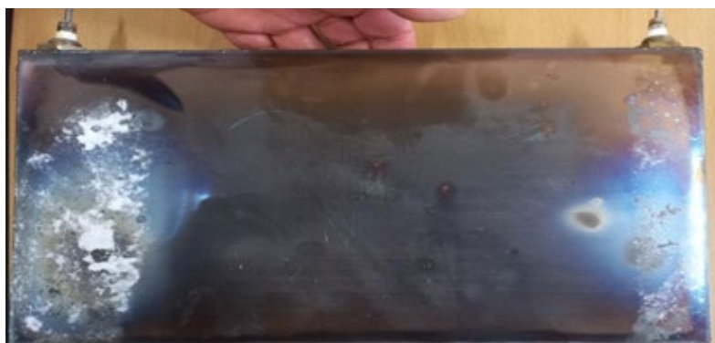
Figure 8: Stainless steel rectangular plate (300 mmx200 mmx20 mm) filled with our materials

the stainless steel heater stick was 700°C, and the temperature of the materials in the stainless steel rectangular plate increased to 1500°C. After this, the stainless-steel heater stick is no longer electrified, and it stops working.