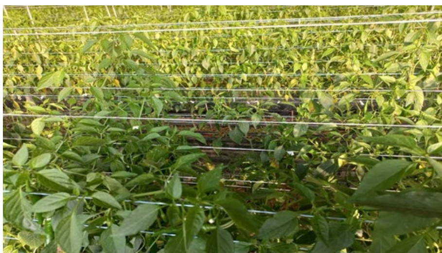
Figure 16: Cheongyang peppers in vinyl greenhouse (3,300m 2 )