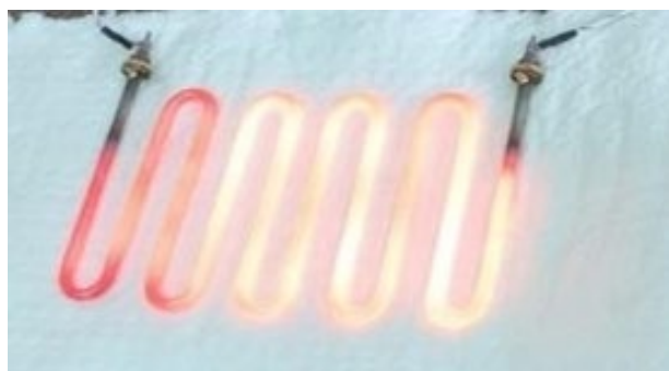
Figure 5: AC 2.5 kW (50/60 Hz)

We increased the electricity capacity to 2.5 kW and added 50% of the materials of our MEGA-STN. We supplied electricity shown in Figure 5, and the surface temperature was 700°C~800°C. Through several experiments, its surface temperature change showed no difference. At this time, the temperature of the internal coil was 1120°C, and the temperature inside stainless-steel heater stick was approximately 1100°C. There was no further change in temperature, and even after a certain period of time, the existing stainless-steel heater stick with 50% of the materials of our MEGA-STN worked stably and was not out of order.