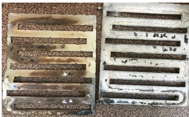
Figure 18: Stainless steel rectangular plate (500 mmx400 mmx30 mm) filled with our materials of mega-stn, which is with the stainless-steel heater stick (ac 4kw, 50/60 hz).