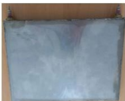
Figure 6: Stainless steel rectangular plate (300mm x 200mm x 20mm) filled with our materials

mal temperature when changing the electricity capacity from 1.5 kW to 2.5 kW. As the electricity capacity increased, the thermal temperature increased. That is, it is found that our materials have a direct effect on heat. Based on these facts, we fixed the stainless-steel heater stick of Figure 5 in the stainless-steel rectangular plate (300 mMX200 mMX20 mM) and filled its remaining space with our materials. As shown in Figure 6, we applied electricity to the stainless-steel rectangular plate (300 mMX200 mMX20 mM) filled with our materials, and its temperature was increased, as shown in Figure 7. At this time, the surface temperature of the stainless-steel rectangular plate (300 mMX200 mMX20 mM) in Figure 7 increased to 850°C, the temperature of the internal coil was 1120°C, the temperature inside stainless-steel heater stick was 750°C, and the surface temperature of the stainless steel heater stick was 700°C, and the temperature of the materials in the stainless steel rectangular plate (300 mMX200 mMX20 mM) increased to 950°C.