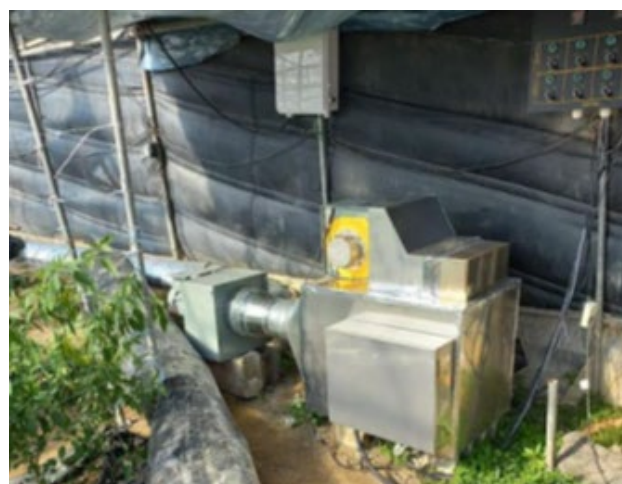
Figure 11: Equipment with our MEGA-STN

We installed two equipment's of Figure 11 in 2,079m 2 of cheongyang pepper vinyl greenhouse as shown in Figure 12 to see the real process of plant growth. Here, our installation was that as shown in Figure 12, we connected a four-meter duct to an equipment in cheongyang pepper vinyl greenhouse 80 meters long and 26 meters wide, and then made four holes one meter apart from each other and connected 80 meters long and 300π whole vinyl to each hole as shown in Figure 13. After this connection, we operated the equipment's. We installed five equipment of Figure 11 in 3,300m 2 of cheongyang pepper vinyl greenhouse as shown in Figure 14. Figure 14 is a cheongyang pepper vinyl greenhouse 100 meters long and 34 meters wide, in which we set up in the same way as 2,079m 2 of cheongyang pepper vinyl greenhouse. We connected 100 meters long and 500π whole vinyl to each hole and operated five equipment's in 3,300m 2 of cheongyang pepper vinyl greenhouse as shown in Figure 14. As above, we made a hot air fan equipment using our MEGA-STN and tried it in 2,079m 2 and 3,300 m 2 of cheongyang pepper vinyl greenhouse.