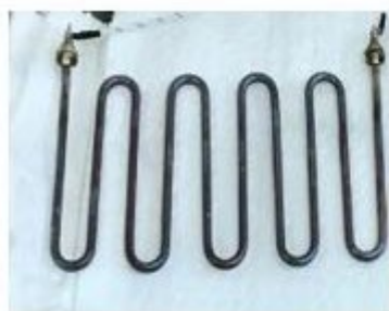
Figure2: AC 1.5 kW (50/60 Hz)

Figures 2 and 3 show the results that is experimented through the existing stainless-steel heater stick. Figure 4 shows that we tested the materials of our MEGA-STN again based on these results. We used the existing 1.5 kW stainless steel heater stick, as shown in (Figure 4), and added 15% of the materials of our MEGA-STN to the internal materials commonly used. The figure of the surface temperature change was 550°C~700°C when supplying electricity in (Figure 4). Through several experiments, its surface temperature change showed no difference. At this time, the temperature of the internal coil was 1020°C, and the temperature inside stainless-steel heater stick was approximately 800°C. There was no further change in temperature, and even after a certain period of time, the existing stainless-steel heater stick with 15% of the materials of our MEGA-STN worked stably and was not out of order.