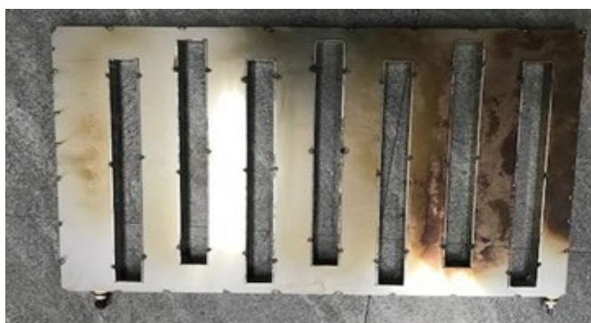
Figure 10: Stainless steel rectangular plate (500 mMx400 mMx30 mM) filled with our materials of MEGA-STN, which is with the stainless-steel heater stick (AC 4Kw, 50/60 Hz)

We installed two equipment's of Figure 11 in 2,079m 2 of cheongyang pepper vinyl greenhouse as shown in Figure 12 to see the real process of plant growth. Here, our installation was that as shown in Figure 12, we connected a four-meter duct to an equipment in cheongyang pepper vinyl greenhouse 80 meters long and 26 meters wide, and then made four holes one meter apart from each other and connected 80 meters long and 300π whole vinyl to each hole as shown in Figure 13. After this connection, we operated the equipment's. We installed five equipment of Figure 11 in 3,300m 2 of cheongyang pepper vinyl greenhouse as shown in Figure 14. Figure 14 is a cheongyang pepper vinyl greenhouse 100 meters long and 34 meters wide, in which we set up in the same way as 2,079m 2 of cheongyang pepper vinyl greenhouse. We connected 100 meters long and 500π whole vinyl to each hole and operated five equipment's in 3,300m 2 of cheongyang pepper vinyl greenhouse as shown in Figure 14. As above, we made a hot air fan equipment using our MEGA-STN and tried it in 2,079m 2 and 3,300 m 2 of cheongyang pepper vinyl greenhouse.