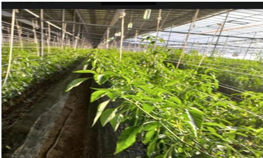
Figure 15: Cheongyang peppers in vinyl greenhouse (2,079m 2 )