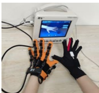
Figure 2: The glove group