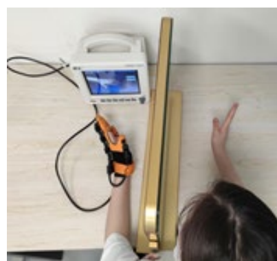
Figure 3: The combined group